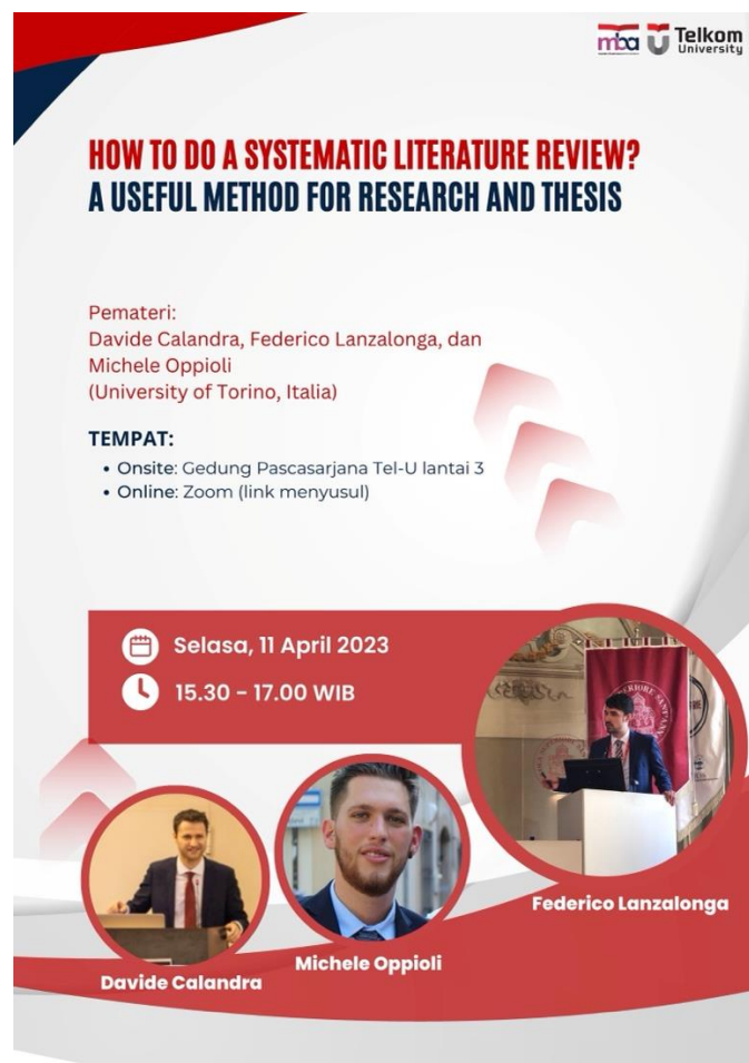
Figure 1. Event Poster

Throughout the discussion, we could take a quick conclusion that this methodology is still not that popular among the Indonesian researchers. Research in Indonesia is mostly focused on empirical methodology. However, having a