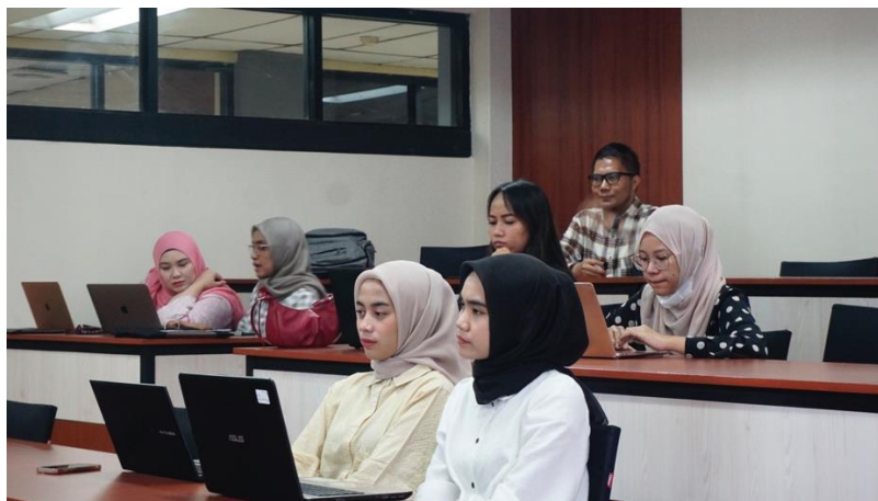
Figure 4. Situation inside the Hall