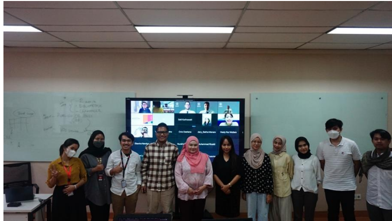
Figure 2. Onsite Participants

structured literature review can provide better build-up to the theoretical part of a research paper (Zaman et al., 2021).