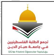
Palestinian Student Society at IZU