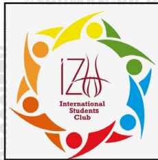
IZU International Students Club