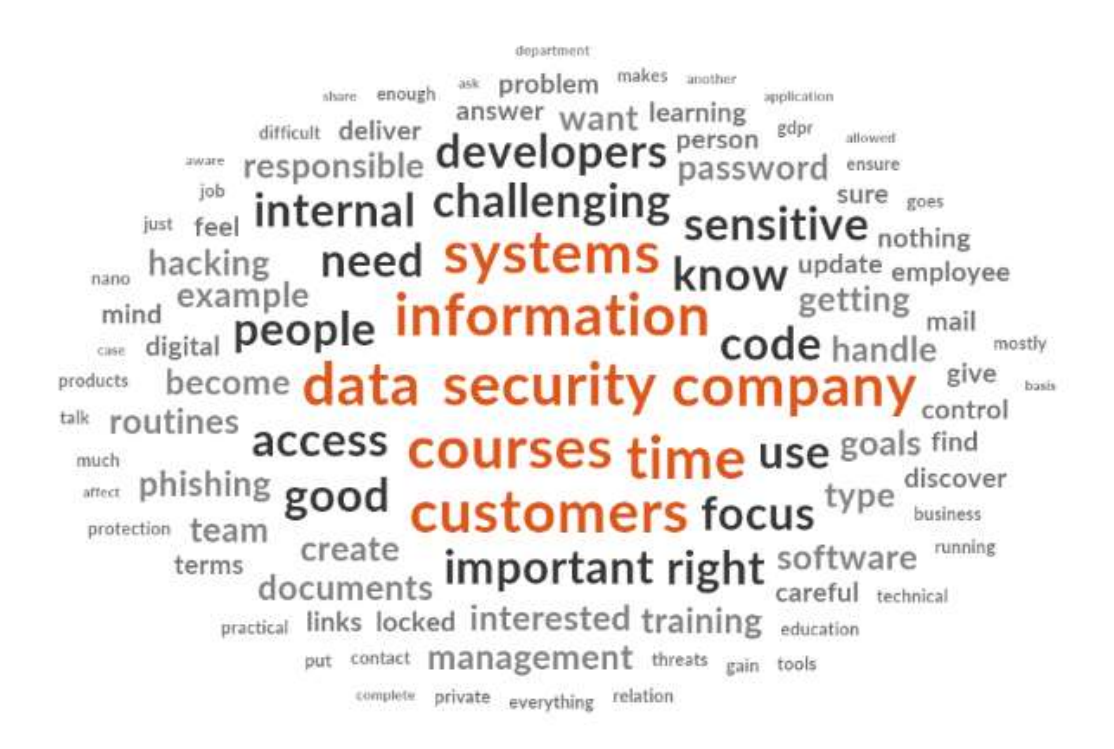
Figure 2 Wordcloud from interviews

In this chapter, the findings from the qualitative study will be presented and my analysis of the interviews. It will explore the different categories set in the Method-chapter by studying the different departments IS ownership, IS knowledge and awareness, and their potential challenges. As this study focuses on different departments, each department will have their own subsection for each section in this chapter.