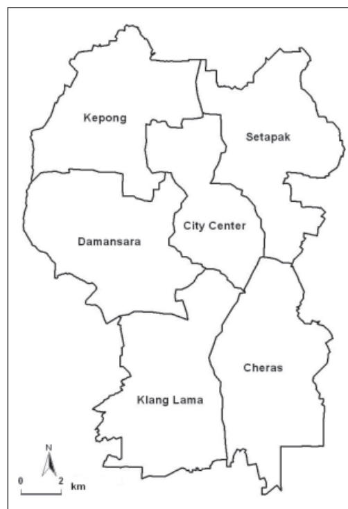
Figure 1. Map of Kuala Lumpur by health zone areas

The spatial distribution of dengue incidence within Kuala Lumpur city was managed and examined using spatial statistic method with ESRI ArcGIS V9.3 program. The point pattern analysis was used to determine whether there is significant clustering of points in the particular area. Average Nearest Neighbor (ANN) Analysis is commonly used to study the point pattern analysis in epidemiology (Moore & Carpenter, 1999). The purpose of the analysis is to calculate ANN Index (R) that relates how clustered or dispersed locations of dengue cases are within the particular area. The ANN tool measures the distance between each feature centroid and its neighbour centroid location. It then averages these entire nearest neighbor distances. If the average distance is less than