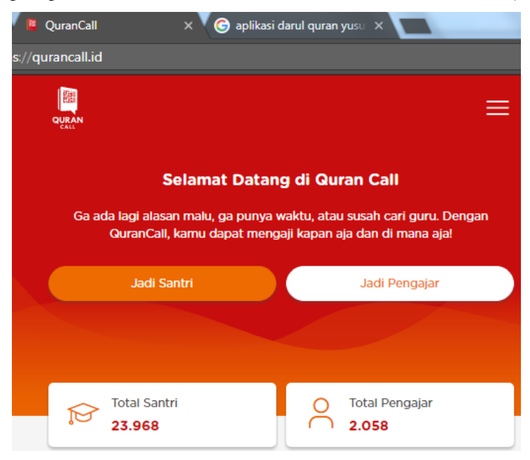
Figure 1 Home qurancall.id (Accessed 2 May 2020)

The qurancall.id web display is shown in Figure 1. This layout provides pages that will serve as information for prospective online students. With the completeness of the description, it will also be one of the promotions so that prospective students are more confident and interested in joining.