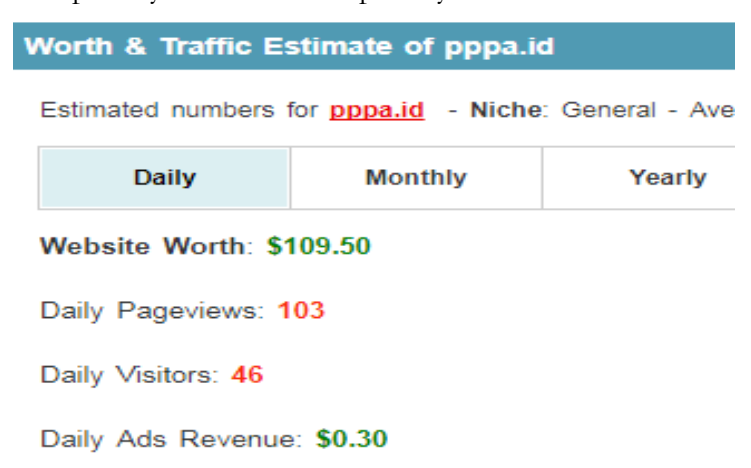
Figure 5 PPPA web visitors (3 May 2020)

The number of visitors to the PPA web (pppa.id) obtained using statshow.com is shown in Figure 5, which shows that the web has 103 impressions per day and 46 visitors per day.