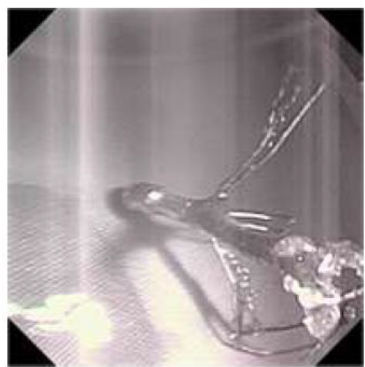
broken dormia basket tip