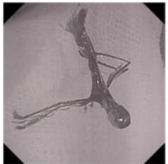
broken dormia basket tip