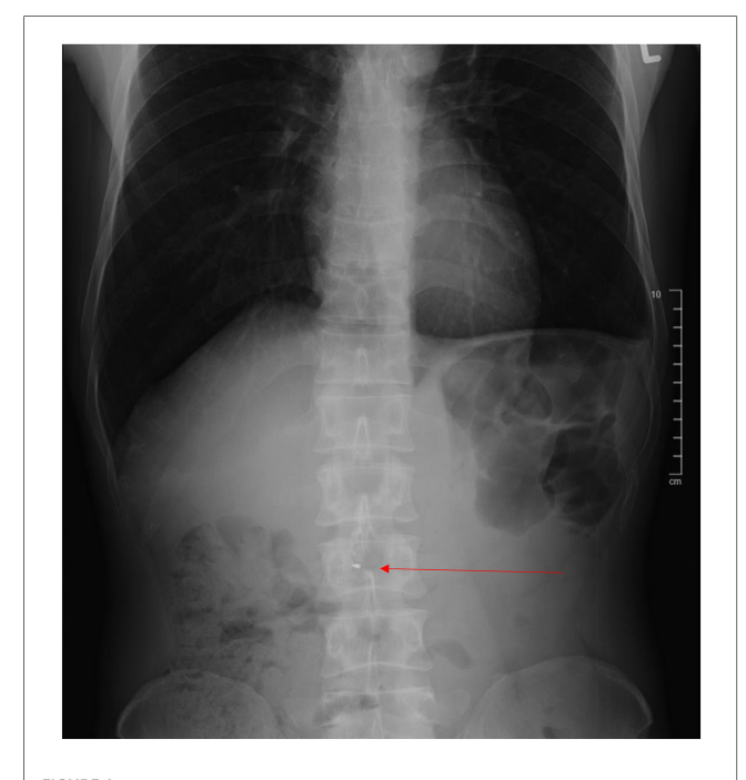
FIGURE 1 Abdominal x-ray

The patient is a 40-year-old male, who was admitted to the emergency department in April 2021 for epigastric pain, which radiated to the back, and vomiting. The patient did not have fever, jaundice, and recent loss of weight or appetite. He was asymptomatic prior to admission. He had a history of gallstone pancreatitis, for which he underwent multiple ERCP procedures