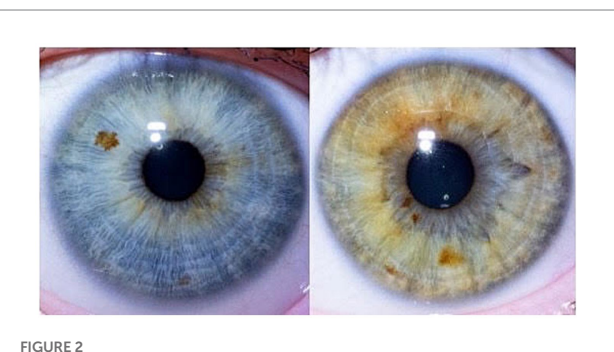
Typical cluster 3 – extended furrows, visible pigment spots.

The current research findings also align with previous suggestions that the development of pigment spots is partly regulated by neurotransmitters produced by the autonomic nervous system (Hu, 2000; Hu et al., 2000). Neurotransmitters are crucial for the function of complex neural systems. For example, dopamine plays a role in the reward system, motivation, and emotional arousal. Serotonin is associated with mood (Loula and Monteiro, 2022) and peripheral tissues (Lv and Liu, 2017). Neurotransmitters