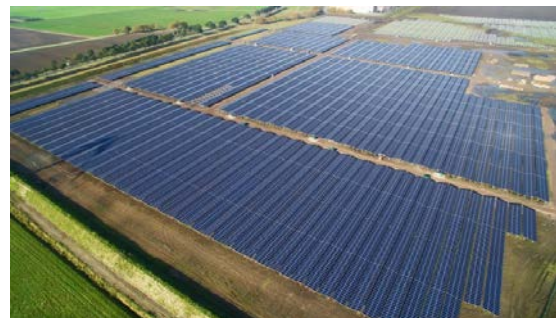
Figure 3: Above: required area to achieve the targets for PV power production in the Netherlands according to the National Roadmap for PV Systems and Applications (Folkerts et al. , 2017). Below: a very large PV system of 30 MW, SunPort Delfzijl (Solarfuture, 2019).