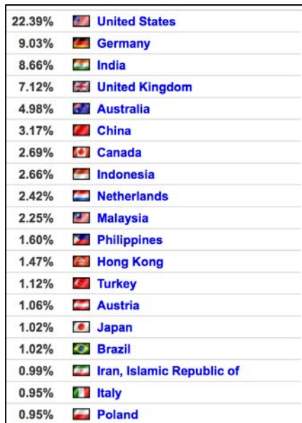
Figure 1. Relative origin of visits to the IJIS.net Web pages: top countries in 2016.

The current issue reflects the International Journal of Internet Science’s international authorship in similar ways: all authors are from all three continents on the northern half of the globe. One article was written at UC Irvine in the United States, one at Utrecht University in The Netherlands, one at University of Düsseldorf in Germany, and one by authors from Fudan University and University of Macau in China.