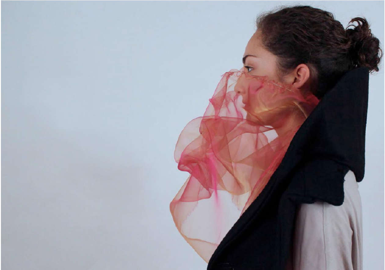
Fig. 4: Aini by Josef Al Abdeli and Gustavo Ostos Rios.

Implications of technology in Case 4: The initial explorations of Aini were based on stiff materials and a big collar. This turned out difficult: the stiff material would not move easily and at the same time there was hardly an opportunity for hiding the motors. But after several more explorations the larger and more informal shape created with an organza-like fabric was found to be easy movable (hardly any force needed). At the same time the motors would easily disappear in the big folds and wrinkles of the fabric. The hood also offered a nice and natural affordance for the control switches, realised as a conductive yarn switch formed by the handles of the hood. If the hood is closed, and hence the (electric) switch is closed, the scarf is up and face hidden. When the user opens the hood, and hence opens the switch, the scarf lowers.