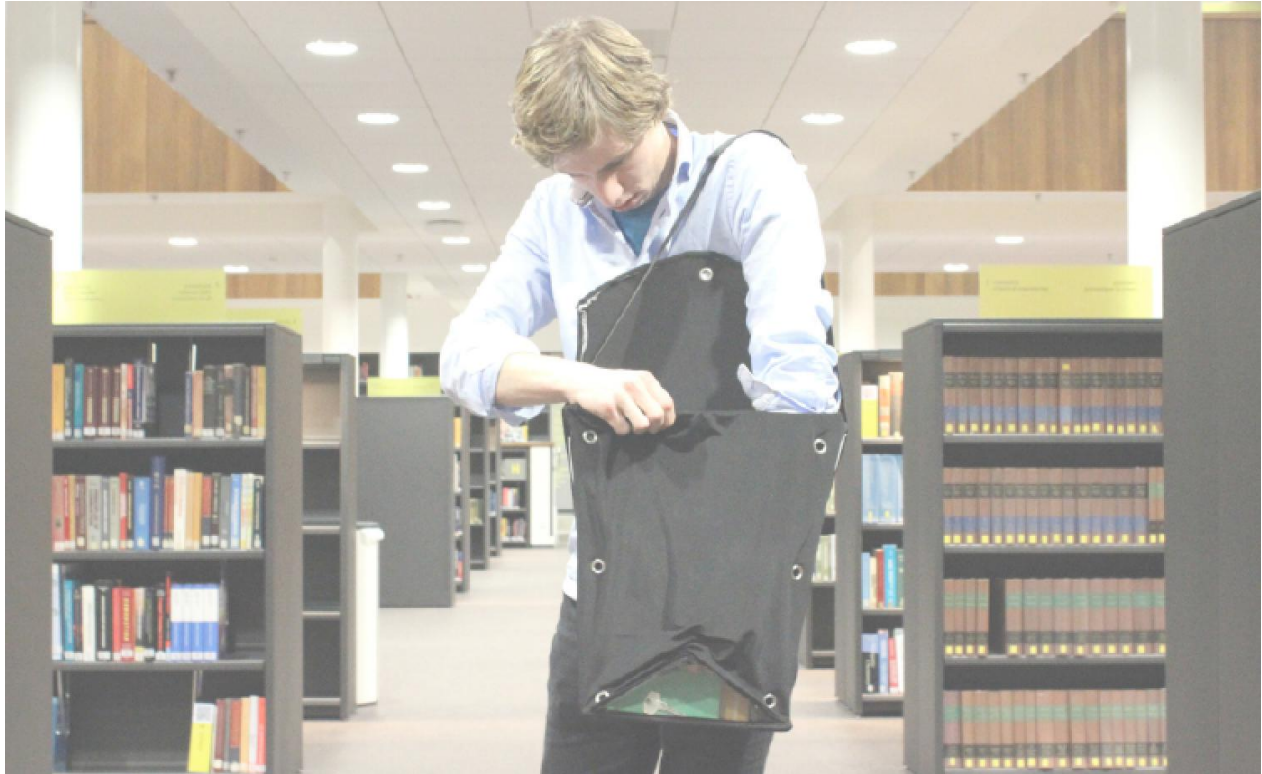
Fig. 5: Actuating bag by Bart de Klein and João Paulo Lammoglia.

The bag consists out of two layers; a stiff transparent one and a thin stretchable black textile layer. By opening the bag the outer layer is lifted by a servomotor. This allows light to pass through from below. Lifting the outer layer also unveils the content of the bag and maybe the identity of the wearer?