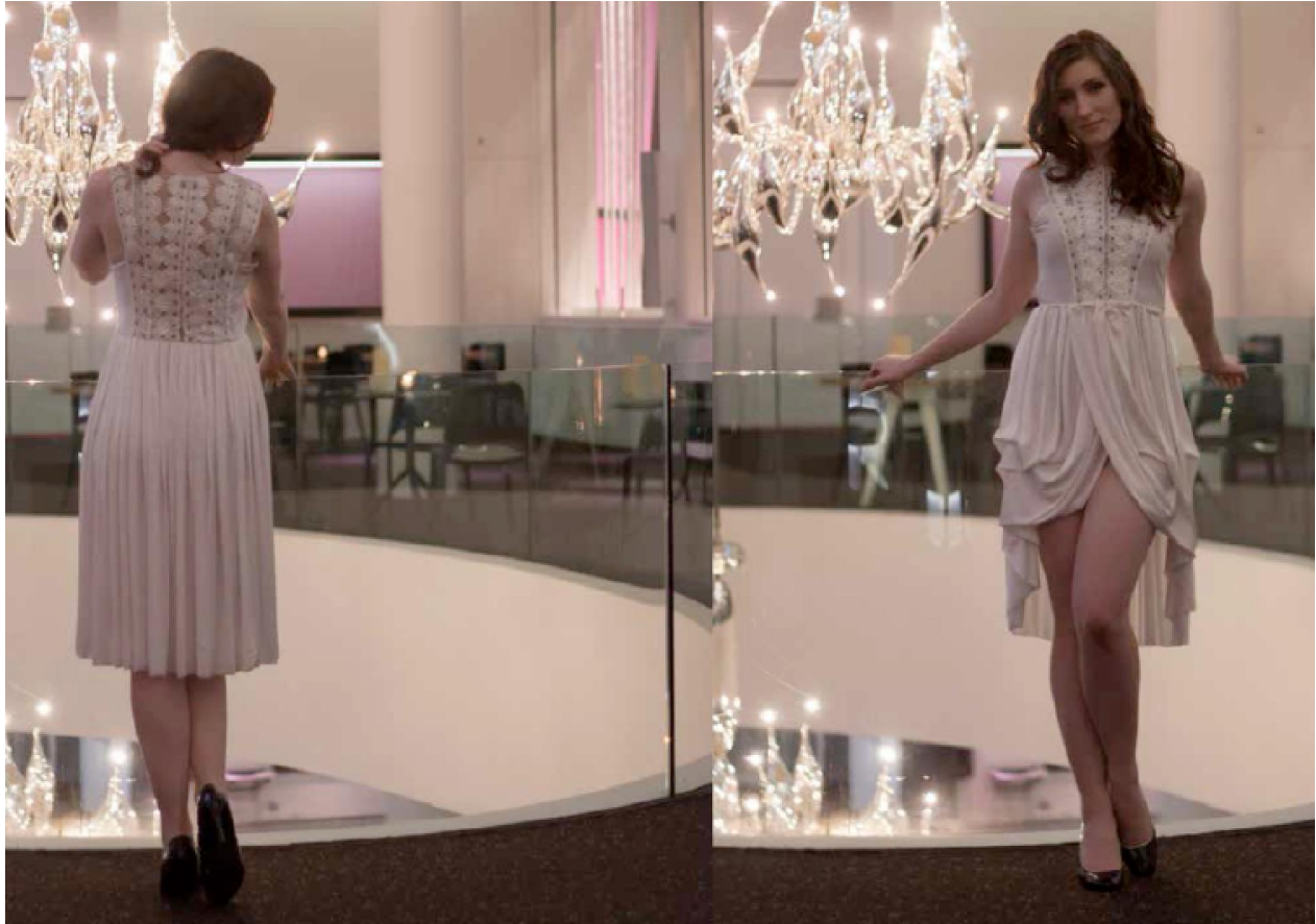
Fig. 2: Sédress by Ardjoen Mangre, Daphne Menheere and Nita Virtala.

Implications of technology in Case 2: For Sédress , the motors could be hidden inside the dress construction of the dress; though not perfect, this worked out not too bad because the embedding and testing of the pulling string was done already in a very early phase. The soft touch sensors are perfect, the flirting movement is picked-up by the sensor, which is made of textile, and the reverse movement is triggered by a software time-out.