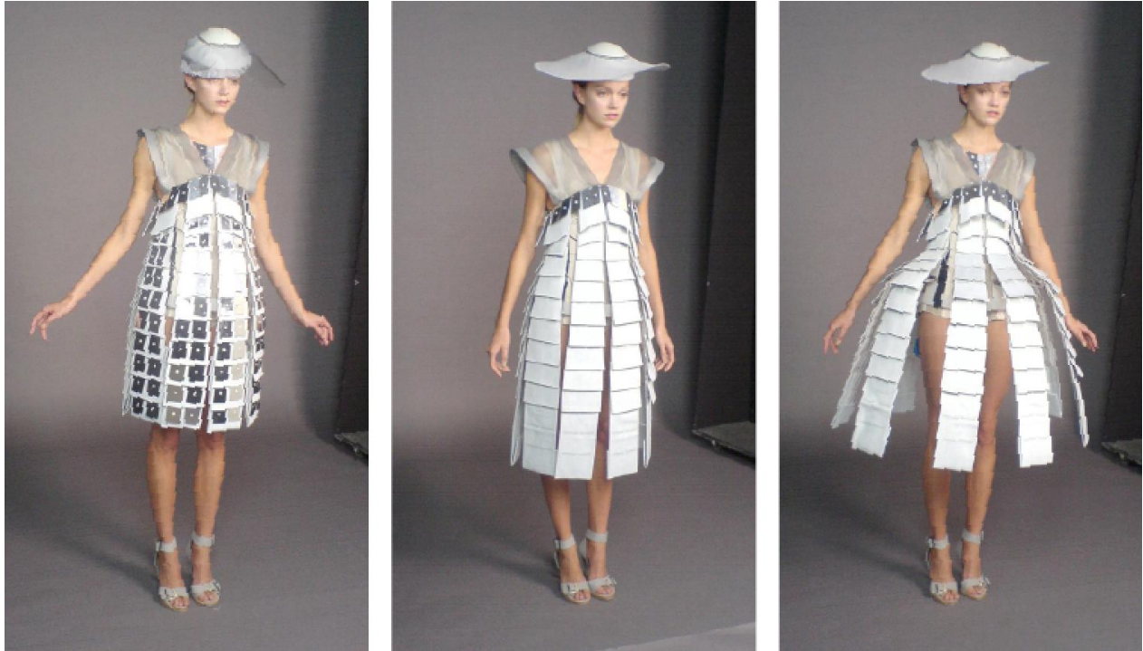
Fig 7. Actuated dresses S/S 2007 (2006) by Hussein Chalayan youtube.com/watch?v=Ae81FcczsI8