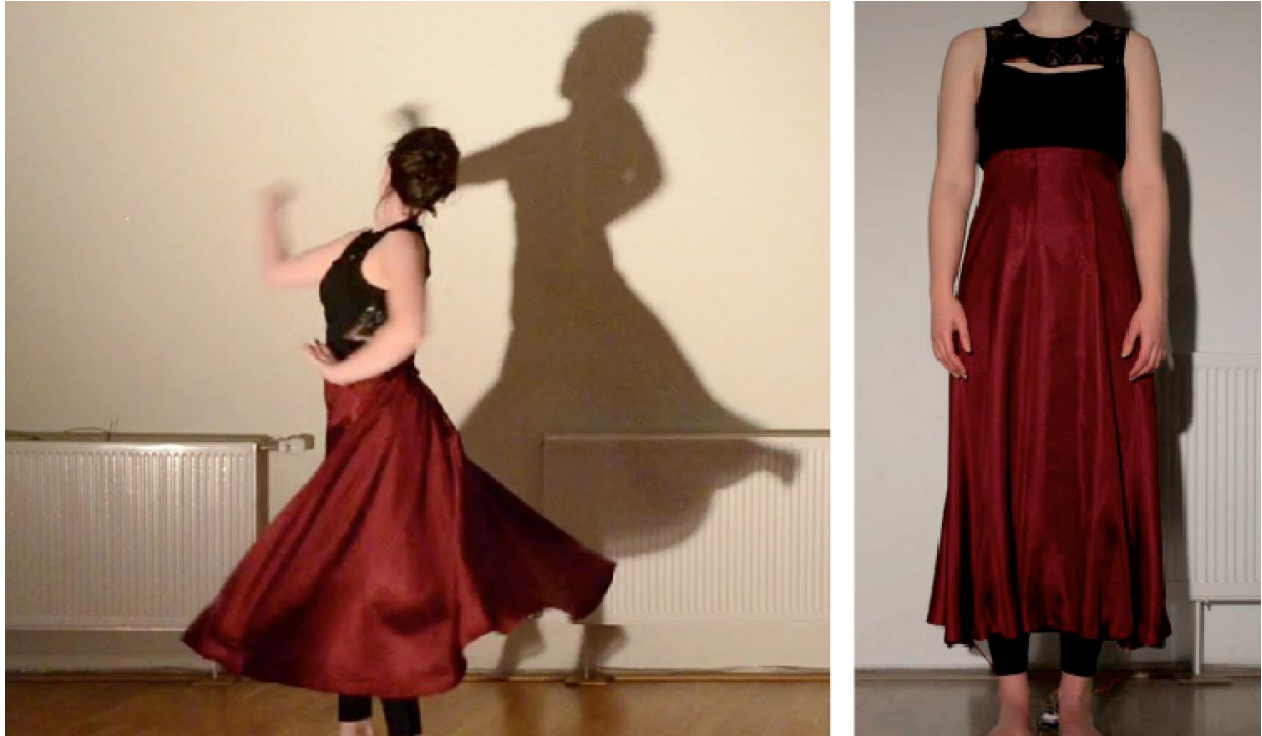
Fig. 1: Moving Skirt by Jesse Meijers and Anne Spaa. Right: Moving Skirt in its most restricted status.

Implications of technology in Case 1: In the concept of the Moving Skirt , the weight of the motors works as a centrifugal weight which helps the outward movement (in the extroverted state of the system). The positioning of the motors inside the lower seam of the skirt is essential (it wouldn't have worked if the motors would be elsewhere).