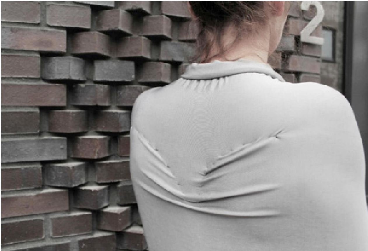
Fig.3: Shivrr by Theodora Kyrgia and Paul Klotz.

Implications of technology in Case 3: In Shivrr , the motors pull a thread with goes through the fabric. While pulling the elastic and frictional counterforces increase until the movement comes to a halt after a few seconds. Because of this, the sound of the motor and its gearbox changes: it becomes louder while going down in pitch until it stops in a grinding way. This sound fits well with the intended semantics of the visual and haptic effect (shivering, a bit scary). The visual, the haptic and the auditory modality reinforce each other. Normally we would consider the noise of the motor and its gearbox to be an undesired side-effect. Here it is a good feature, however.