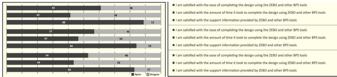
Figure 1, The After Scenario Questionnaire Results of the EECA, FOFA and OPEN groups respectively

Decision-making attitudes and patterns: Another self-reported usability metric was a post-workshop questionnaire that was administered to participants regarding how far using ZEBO and other BPS tools informed their decision-making and led to higher reliability and robustness of the NZEB design. Participants were asked to fill in an online questionnaire with six questions.