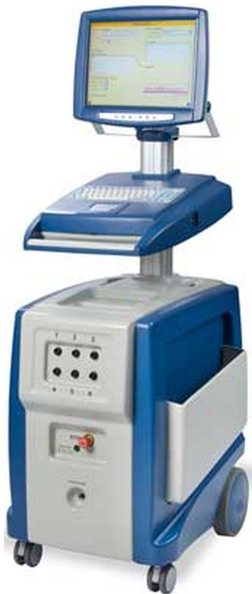
Figure 1 Low Energy Direct Current Electroporation System (NanoKnife IRE System, AngioDynamics).

C8.0–4.0, L10.0-5.0; Athens 2102 Falcon and 2202Pro Focus, BK Medical, Denmark, equipped with an endocavity probe models 8658 and 8848) will be used to visualise the prostate in sagittal and axial direction. The volume and shape of the prostate will be determined. These data will be entered into the planning software system. The specified area will be chosen for ablation. Two up to six 19-gauge unipolar electrode needles will be inserted transperineally using a brachytherapy grid under continuous ultrasound guidance (figures 3 and 4).