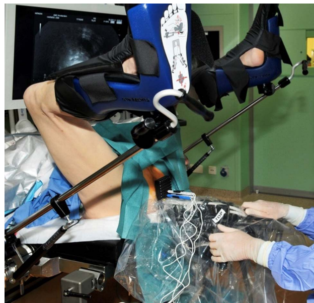
Figure 2 Patient placed in extended lithotomy position with transperineally inserted electrodes using brachytherapy grid under ultrasound guidance.

For an extended ablation with >4 electrodes, 2 electrodes will be repositioned followed by a second IRE course including the 4 electrodes in place. The locations will be verified using sagittal and axial ultrasound images of the prostate. Minimal distances between the needles and