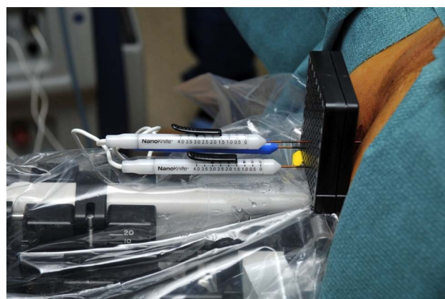
Figure 3 Three electrodes transperineally inserted through a brachytherapy grid.

Data will be presented at international conferences and published in peer-reviewed journals. The study is conducted and funded by the Clinical Research Office of the Endourological Society (CROES). The CROES is an