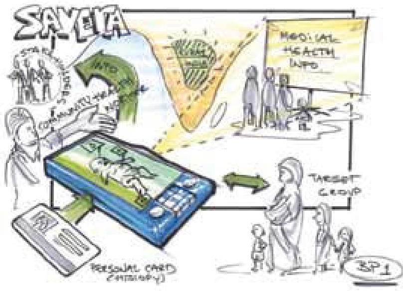
Figure 1: Initial value proposition of the Savera project