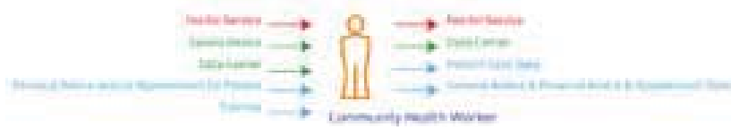
Figure 3: Balancing value flows for community health worker

as intangible values. By continuously asking what values were important for each of the stakeholders to participate, the model was enriched.