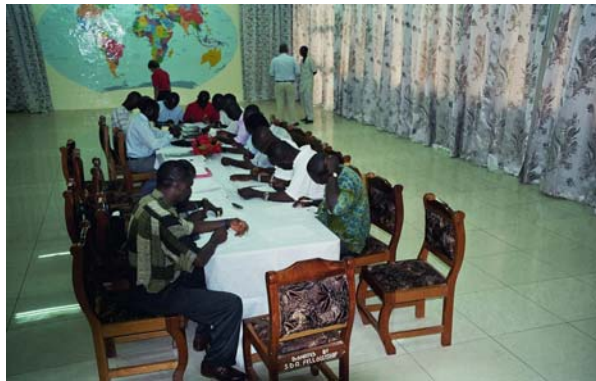
Fig 2 Interviewing Sunyani PT staff

The results of the questionnaires among the PT staff show that theoretically most of the topics could be taught by the available staff. Some topics will be taught by teachers from other departments due to the typical specialism (e.g. law etc.). It should be noted however that especially in the case of the Cape Coast PT the present teaching capacity is not sufficient. Only a limited number of teachers are at present employed in Cape Coast. Both PT's have indicated that they will attract new staff with a Bsc or Msc degree in near future, in order that the staffing problem is likely solved both in quality and quantity after the project period.