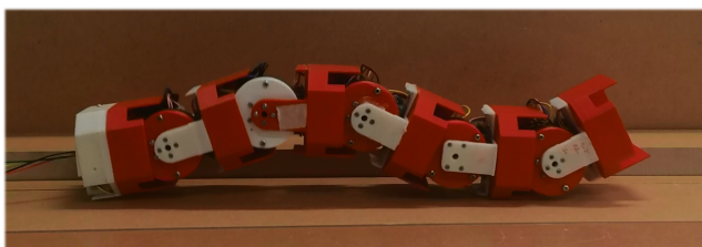
Figure 1: Rectilinear locomotion of a modular snake robot.

Learning from natural phenomena is widely considered to be important in developing key innovations and has been an inspiration for engineers for decades. One of the fascinating fields in research is the field of biologically inspired robotics [1]. This study will revolve around the locomotion of a snake robot [2]. Due to its small cross-section, a snake robot is ideal for locomotion in confined spaces. Snake robots can be used to inspect a pipe, a collapsed building or areas that are difficult to access by any other means. A unique characteristic of a snake is that it is very flexible. It can turn with little space and can propel itself forward using the environment whereas other robots generally avoid contact with obstacles. The goal of this study is to develop a generalized model for the 2-D locomotion of the modular robot snake depicted in Figure 1, developed at the University of Canterbury [3]. The aim is to have a single framework that can be used to model lateral undulation as well as a rectilinear locomotion.