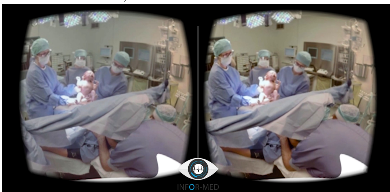
Figure 1. Screenshot from the 360 virtual reality video at the moment of birth.

and their partners were continuously involved during the development of the video to allow us to include their feedback on the images, text, and changing the sequence.