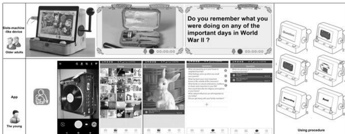
Fig. 2. Prototype of 4th iteration

(Section 3.1). Next, new and unexpected findings emerged during the implementation of prototype, which guided our follow-up research. Our second prototype was regarding life stories of the elderly. However, new and unexpected findings emerged during its implementation: some stories were related to family