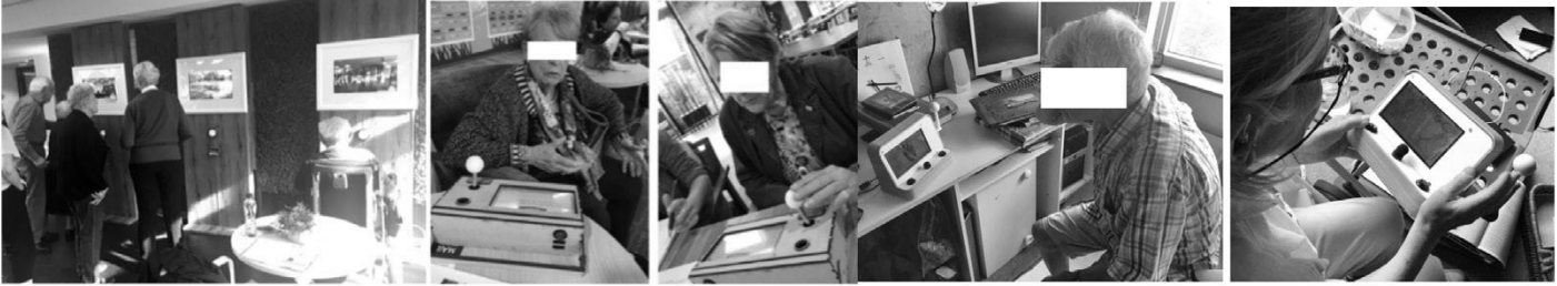
Fig. 3. Interview with older adults in different iterations

mementos, such as album, souvenir, artwork, etc. This inspired us to explore their mementos and related stories in the next iteration (Section 3.3).