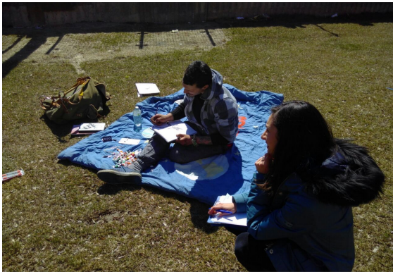
Figure 2. field investigation in Montreal at CHI '18