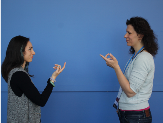
Figure 1. Mirroring another person typically used in social situations to show empathy

Public transport; prosocial behaviour; mood induction; empathy games; playful intervention; benevolent behaviour; gamejam