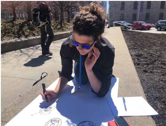
Figure 3. . ideation phase in Montreal at CHI '18

games can support social change, for instance by improving attitudes towards social issues [13], increasing the willingness to help others [12] and supporting prosocial behaviour [9,16,17]. These games often support social change by inducing empathy through the depiction of social issues, and motivating people to take action [16].