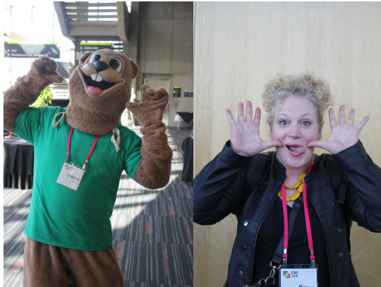
Figure 4. Impressions from the on-site testing