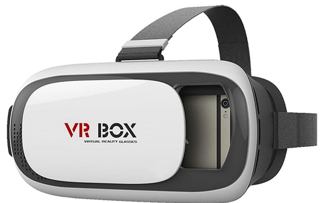
FIGURE 2 VR headset [Colour figure can be viewed at wileyonlinelibrary.com ]

Real-life classroom events can be displayed via VR and provide learners sensory and imaginary experiences similar to real-life experiences (Yoh, 2001). Watching 360-degree videos with VR headsets appear to be more attractive to learners because of the immersive user experience (Martín-Gutiérrez et al., 2016), which disconnects the user from (distracting factors of) the "real world" (Olmos-Raya et al., 2018). VR gives a feeling of presence (Yoh, 2001) and a sense of embodiment (Kilteni, Groten, & Slater, 2012) in a virtual environment. This way, the user is involved in a realistic and authentic situation without being physically present (Martín-Gutiérrez et al., 2016). VR experiences can help bridge the gap between theory and actual teaching practice (Dede, 2009).