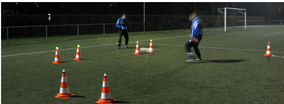
Figure 2: SmartGoals in use during soccer training. In total 6 goals are used, of which always 2 are in an 'on' state.

events from short term memory. If the last event in the pattern involves a state transition of itself, this pattern will be reinforced in long term memory. The long term memory can hold up to 10 of these patterns. In a continuous process of forgetting and reinforcement, only the most important patterns are sustained in memory. Though every single agent can only remember patterns of length 3, the system as a whole can learn much longer patterns.