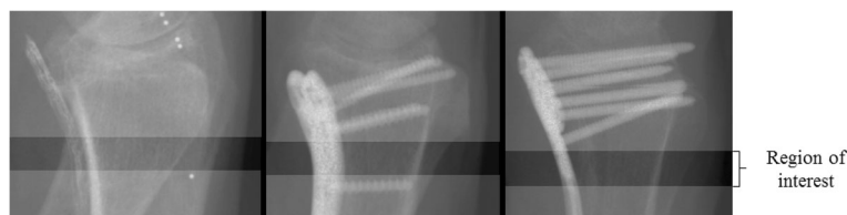
Fig. 2 Lateral scoutviews of each instrumented radius showing the region of interest (ROI) in each radius. The ROI was chosen at a location where the radius was fully covered by a part of the plate without holes and that was not intersected by screws. The tantalum fibers in the CFR-PEEK plate (left) allow visualization of the plate

Means for the bone parameters in each instrumented and uninstrumented radius were calculated from the duplicate measurements. The errors in the bone parameters introduced by each plate were expressed as percent differences