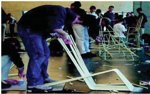
Figure 1. Electric installation pipes used for making seats.

A combination of PVC pipes (the well-know yellow electric installation pipes) and tie-wraps have lead to surprising results in an assignment to make a seat. Students were free to select the type of seat in this design. PVC pipe is an inspiring material to build things in this kind of exercises (Figure 1). Yet, it is very much a material with its own character. Tie-wraps offer different simple ways of connecting. Making a chair from this floppy material is not that simple, especially since students had to make an object that can bear the full weight of a person.