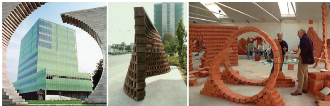
Figure 5. Entrance gate (left hand side) and bus stop (middle and right hand side)

Throughout all the years, there were sPectakels that used brick as a composition material to make all kinds of objects. The first time was based on sand-lime bricks with the assignment to design an entrance gate that could direct visitors coming from the railway station toward the central porter's lodge on the campus (left photo in Figure 5). This design was reconstructed afterwards on the proposed site (after all permits were organized) and remained in this function from 1997 until 2005.