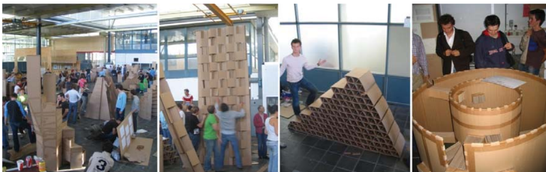
Figure 2. stairs made of cardboard perform much better than initially expected

Another example, “stairway to heaven”, shows results of an assignment where students had to build a stair from maximum 4 m 2 cardboard with masking tape as the only allowed connection material (Figure 2). The stair had to be as high as possible and strong enough to carry a student who had built this object. The properties of cardboard were used in many different ways adding beauty of the structure in many designs. Some stairs could be used to sit upon.