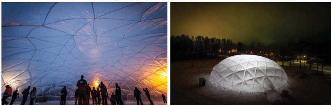
Figure 10. inside and outside of the ice dome

The dome was built on an abandoned agricultural landscape near the small town centre. Two graduate students arranged help from 50 students who travelled to Finland for several weeks and with support from a number of local enterprises, too. The dome was completed in January 2014, measuring an internal span of 30 meters. This made this dome the world’s largest ice dome. To create such a large span by an unusual material needs an innovative method of building. This construction method as well as the actual realization of the dome was part of a research project. And since the period with low temperatures was still rather short, the construction method developed to construct the dome had to be relatively quickly. This was found in a system based on a big inflated mould, in fact just a big balloon. After inflating, the air-pressure was kept on a continuous level in order to reduce deformations.