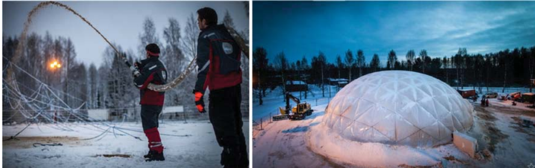
Figure 9. spraying water and fibers on an inflated mould (photos by TU/e, Joep Rutgers)

The “Ice- or Pykrete Dome” is a students’ project based on research on fiber reinforced ice. Adding fibers of, for example wood or paper, increases the strength of ice. This fiber-reinforced ice is called Pykrete and it also turns ice into a slow-to-melt material that is more suited for building in an extremely cold climate. The ice shell structure made by students was built in Juuka, Finland, in a region where winter temperatures are far below 0°C.