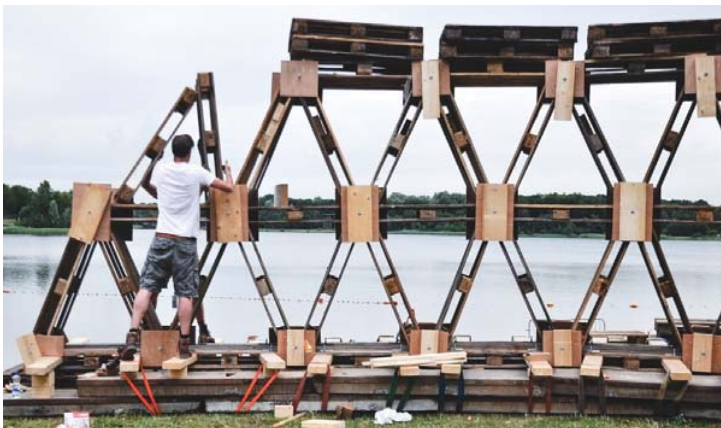
Figure 16. honeycomb structure with a view to the lake

The result is a stage composed of 600 pallets, that embraces visitors and provides an intimate environment within the crowded festival. The DJ booth is placed in the center, making this tactile and experiential for visitors (Figure 15). Ensuite is a semi-circle with a diameter of 20m and height of 4.5m, similar to an arena. The semi-circle has three main layers (Figure 16). The first is a base of horizontal pallets, leveling irregularities in the ground and also providing ballast weight as stability means. The second layer consists of pallets in a honeycomb structure made of triangles. In this way the pallets frame the views to the nearby lake. The third layer is a crown of vertical pallets, used for lighting and sound equipment. The project was built in six days and dismantled in two, requiring tools only as advanced as an automatic screwdriver.