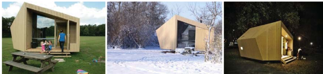
Figure 11. three Trek-ins on different camping site and different seasons

The Trek-in started as part of a competition celebrating the 25 anniversary of Bouwkundewinkel of TU/e (Moonen, et al., 2010). This competition was won by a team of two students, and next a team of six students was put together to elaborate on their concept. In the first weeks the collaboration in this group was rather problematic, since the winning students didn't accept involvements of the others. However, the fact that they needed each other to create this real object helped the students to overcome the initial arguing. After some intense meetings, all students expressed their ambition to cooperate and to elaborate the concept into a final design. After this design was made three of the six students further elaborated on drawings for realization, in close cooperation with industry, and supported by a government grant (STIRR, 2011). This resulted in a prototype, presented at the Dutch Design Week 2012 (Moonen & Hermans, 2013).