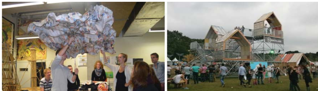
Figure 17. Master studio (left) that resulted in the SummerLabb pavilion (right)

In analogy with earlier projects, the initial design was followed by a selection of most feasible concept. A group of three students was put together who elaborated on technical and practical issues of the concept for realization. In the next phase a group of in total 57 students was involved in the making 18 pavilions.