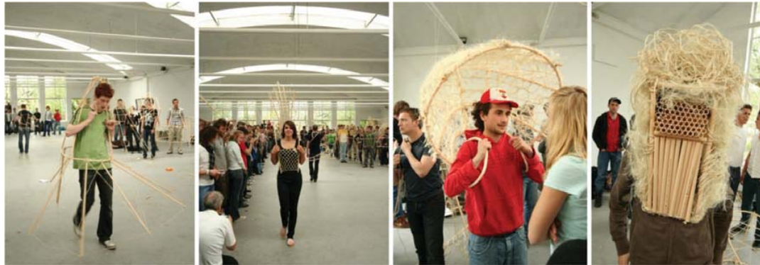
Figure 3. Students showing their interpretation of private space on a catwalk

Another sPectakel that showed unexpected results is the assignment where students had to build their own private space, made of PVC-pipes and rope. In “From Chair to City; A Story of People and Space” Bakema (1964) explains the relation and transition from small surroundings (of a chair) to the big world (the city) and describes the fluent transition of private to public space (Ibelings, 2000). This sPectakel started by a presentation in which ideas behind transition of spaces were set out. On this basis, students also had to deal with transitions by building their own private space.