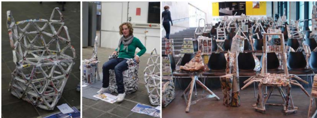
Figure 8. Variety of amazing chairs resulting from 2 nd paper-clip-chair assignment

But also braids of paper were used, as seen in Figure 7. Most chairs used a lot of tape to make the paper strong enough to withstand the load of a person's weight. Paperclips were also used in different ways, such as to hold sheets of newspaper together. Some groups used paperclips to make chains.