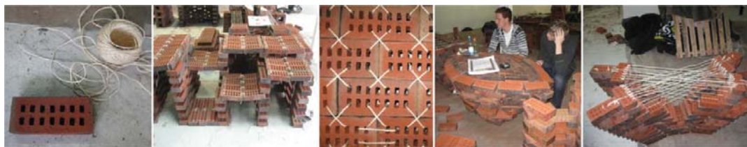
Figure 6. Assignment to design a table made from bricks and ropes only

A second time that bricks were used in the sPectakel was in the assignment to develop a students' meeting point for excursions. So a kind of landmark on the TU/e campus had to be designed with the function of a bus stop that is easy to describe where to meet. Figure 5 shows a result (photo right examples during the sPectakel, photo in the middle the bus stop that is actually realized). The winning bus stop was built afterwards and is still used as meeting point for excursions (in use since 1998).