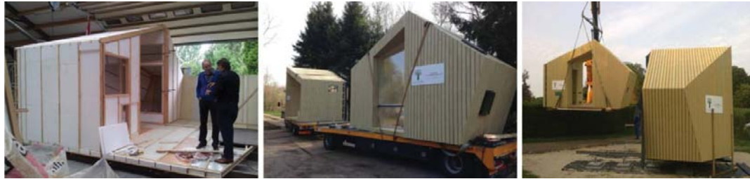
Figure 12. the Trek-in is made out of materials from demolition and fully prefabricated

All insulation of the prototype too, is reclaimed from demolition by combining old ceiling tiles until the required thickness is achieved (Hermans & Moonen, 2013). Ceiling tiles are made from mineral wool thus suited for insulation buildings and are scrapped in large quantities when offices are dismantled. And also interior parts as light switches and curtain rails can be re-used, too. Hardly any new materials are needed (Moonen, 2014) apart from two large glass plate, heating equipment and waterproof layer. The materials history of each Trek-in is now a characteristic feature by its personal story. The origin of all materials is documented in a certificate of origin for each Trek-in. This certificate adds an educational slant to a stay in a hikers' cabin: especially for young visitors.