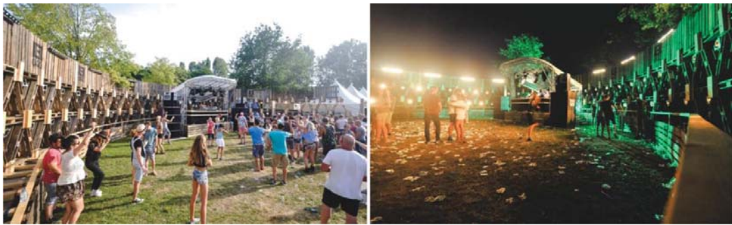
Figure 15. Stage of just pallets

Organizers of the Extrema Outdoor Music Festival (an electronic dance festival at the shores of the recreational lake Aquabest near Eindhoven) contacted the Dept. of the Built Environment (TU/e) in 2015, asking whether students could develop one of the stages. About 15 students of a master studio started this assignment as small exercise in a larger design project. After all students had made a concept, a winning idea was selected in coordination with the festival organizers. In order to make the assignment more challenging, the supervisors of the festival added an extra challenge: students had to create a stage by using pallets only. This idea was elaborated by four students of the studio. These four students not only have designed the stage called “Ensuite” at the 20 th Extrema Outdoor Festival, but also have built the structure with the help of students/friends at the shores of Aquabest.