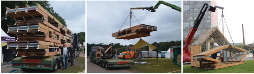
Figure 18. Stacked transport and fast unfolding on site

The pavilions are hinged to point out that building industry is a source for high volumes of traffic due to frequent moving materials with many people working on site. Developing a folding pavilion to reduce its volume during transport enables to discuss this aspect of sustainability on festivals in a playful means (Figure 18).