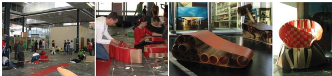
Figure 4. Linoleum is a tough material to use, yet results makes up for a lot

Linoleum was used in another workshop that asked to make an object to sit on. The only additional materials that were allowed to use for making connections were tie-wraps (max 100). Linoleum, also called Lino, is normally used as floor covering. The upper layer is made from linseed oil and pine rosin with aggregates (cork dust, wood flour, and mineral fillers) applied on a canvas backing. Linoleum is available in a wide range of bright colors (Figure 4). In this assignment only vivid colors were selected, making the contrast even bigger.