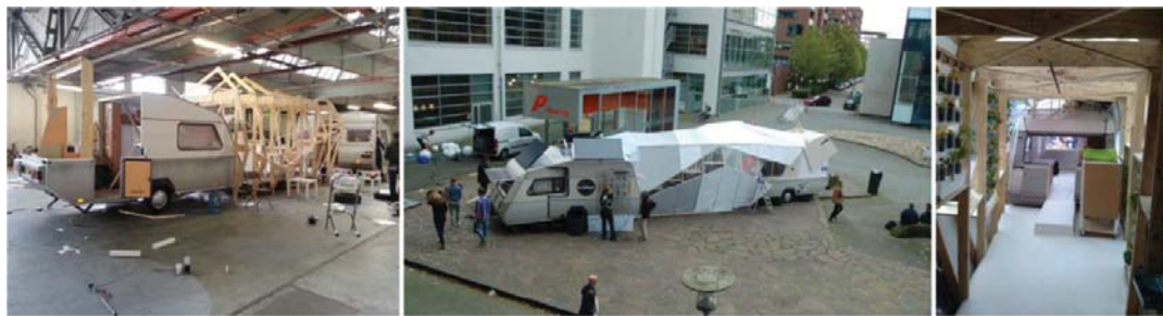
Figure 14. Preparing caravans: students work in a vacant production shop (left) and during the 'two-day isolation mission' at DDW 2013 (middle and right)

Seeker [EH3] seeks to realize a closed environment that is as independent as possible from the outside world. In a semi-autonomous system, Angelo Vermeulen considers different technological solutions (regarding supplying and stocking energy, water, food, as well as furniture, plumbing, etc) and ecological solutions (experimenting with systems to grow food, such as hydroponics, aquaponics, germs, etc.). The research by doing experiment in Eindhoven relates to integration of technological, ecological and social systems for long-term survival in a spaceship.