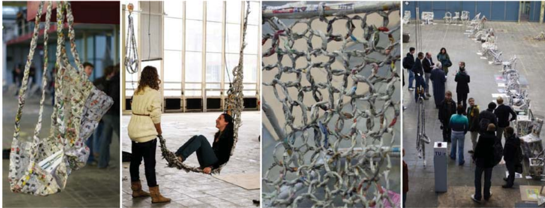
Figure 7. first assignment of the paper-clip-chair (2008)

Paper is also a material that challenges students to realize exceptional creations. In the assignment, called paper-clip chair, students had 50 newspapers, 1000 paperclips and 66 meters of tape at their disposal for making a chair. There were strict requirements, such as the height of the seat surface had to be at least 45 cm and a backrest was required. The main given material: old newspapers seemed an impossible construction material. Yet, it proved that this material released a lot of creativity for freshmen to make chairs out of this.