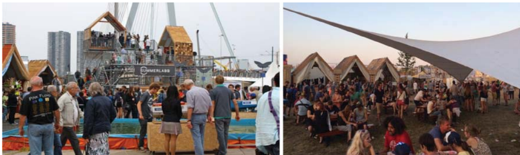
Figure 19. SummerLabb at Wereld Haven Dagen (left) and at Pukkelpop (right)

The pavilions are hinged to point out that building industry is a source for high volumes of traffic due to frequent moving materials with many people working on site. Developing a folding pavilion to reduce its volume during transport enables to discuss this aspect of sustainability on festivals in a playful means (Figure 18).