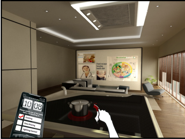
Fig.3. Smart Design prototype interface

In discussion with the designer, the client expresses his/her appreciation, misunderstanding, disapproval, etc, and makes suggestions for improvement of the design.