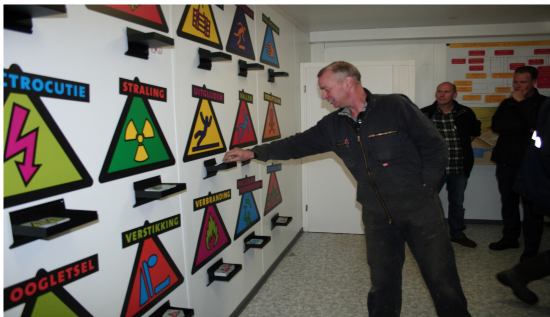
Figure 5: Interactive training exercise, in which workers select a risk category that is particularly salient for their work, and talk about possible prevention strategies

To assess the efficacy of our interventions, we applied a range of assessment methods from the behavioural sciences. Not every assessment method proved effective. For instance, we used an attention-measuring paradigm often used in cognitive neuroscience: an oddball task, in which subjects have to detect, amongst a series of standard stimuli, an infrequent deviant one (Garcia-Larrea, Lukaszewicz, and Mauguière, 1992). To have workers participate in this oddball task, we constructed a booth outside and inside the gate, to compare response times in the task. We hypothesized that greater attention would increase reaction times inside the gate, but the distractions and the diversions of the real world on the workplace made this measurement infeasible. Similarly, an assessment of quality and quantity of various safety protocolling techniques, through which we hoped to assess a general increase of safety-related reports and a higher quality of safety-related feedback, was thwarted by the introduction mid-assessment of a new protocol registration form by management. Fortunately, a content analysis of safety meeting minutes, and feedback sessions from external safety quality assessment professionals, showed an increase in safety motivation behaviour, especially in participation in safety-related meetings.