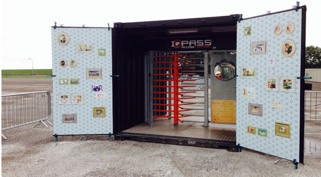
Figure 3: A gate emphasizing the transition between the relative safety of the changing area and the relative dangers of the working zones. The exit to the relative safety outside the building site is visible.

Three interventions were developed. Firstly, as mentioned before, we designed a gate that makes the transition from the 'safe' changing rooms to the implicitly dangerous working zones tangible. Usually, this transition is passed through without noticing, which does not encourage taking the relative dangers of the workspace into account. The gate, which had to be passed in order to enter the building site, emphasized in its design exactly the relative dangers of the work space and the safety of the changing rooms. Secondly, we developed an intervention in which small groups of plant workers make a tour of the construction site and mark and report potentially dangerous issues on the building site, seen from their professional perspective, using a map derived from an aerial photograph (figure 4). These insights are then used for discussion in the next day's start-up meeting. Thirdly, we developed an intervention for plant safety trainings in which workers select a card containing a specific aspect of work safety from a deck. To encourage active responsibility for work safety, workers think through and discuss how this particular aspect of work safety relates to their work practices.