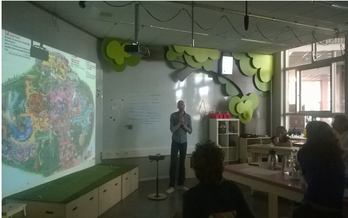
Figure 2: Design pressure cooker with design researchers, service designers, and behavioural scientists

Behavioural sciences' distinction between automatic and reflective aspects of behaviour proved useful in this phase. Much attention went into devising concepts that aimed at automatic behaviours such as habits and impulses. On the other hand, designerly techniques such as thinking in metaphors also proved fruitful. One example of such a metaphor is diving, where buddies take care of each other's safety after heavy training on automatic behaviours and habits applied both under and outside of the water. The diving metaphor resulted in an experiential intervention shaped like a gate that emphasises the transition from the 'safe' changing rooms to the implicitly dangerous working zones at the gas plant (figure 3).