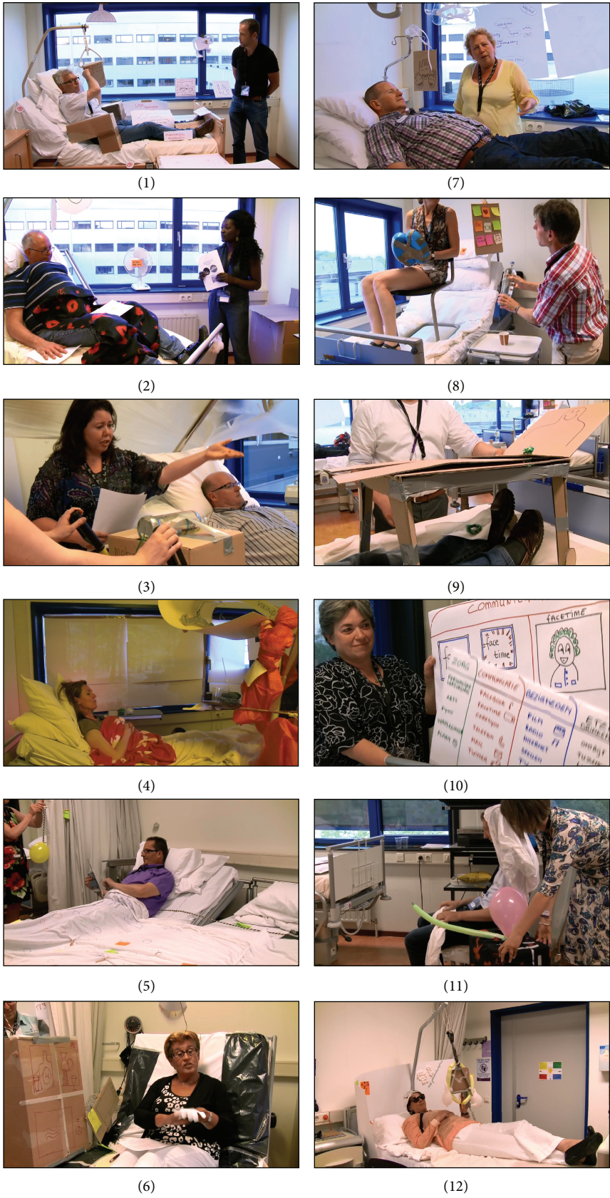
FIGURE 3: A composition of the twelve scenarios written and enacted by the participants.