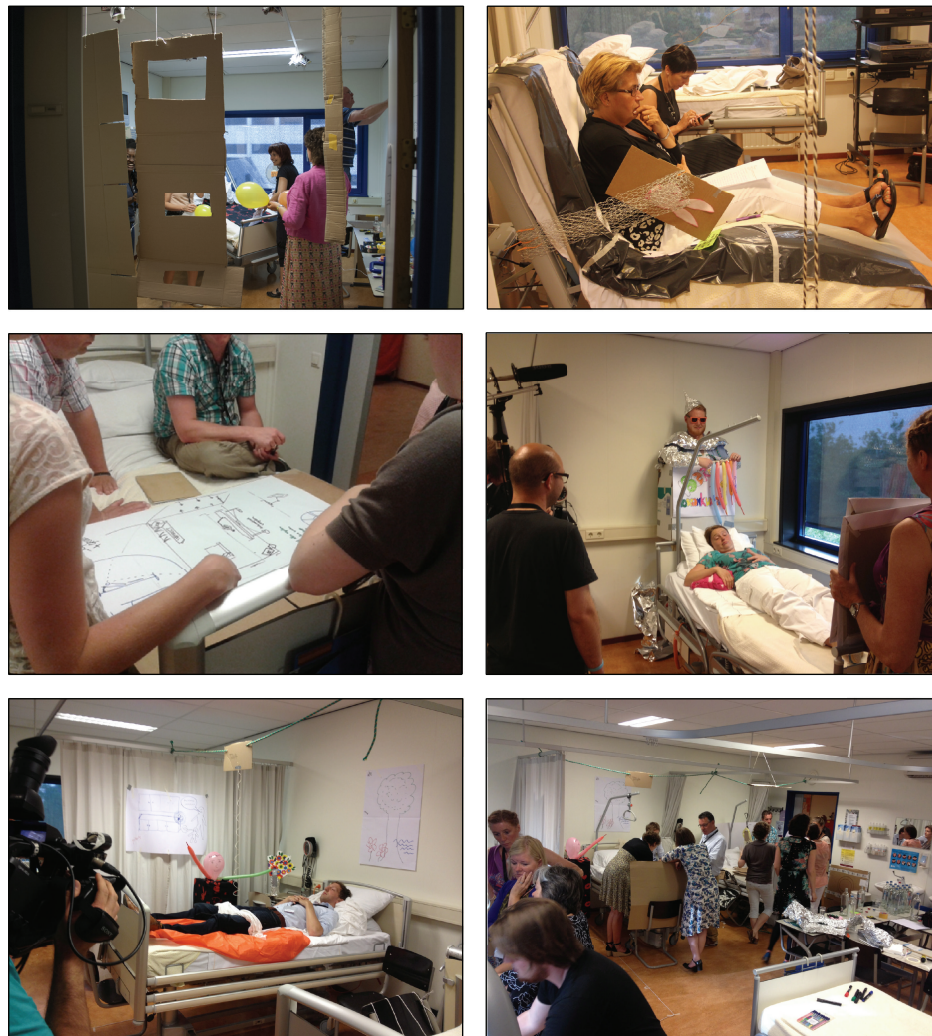
FIGURE 2: Working together to generate ideas, followed by the enactment and filming of the scenarios.

egos technique liberated the majority of participants from the fear of straightforwardly exposing themselves, supported and enhanced their introspection, stimulated their creativity, and helped to establish an informal and constructive atmosphere throughout the design sessions.