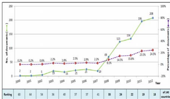
Figure-2. The total research of the AI from 2000-2012 for the Malaysia country (ScImago Lab, 2014).