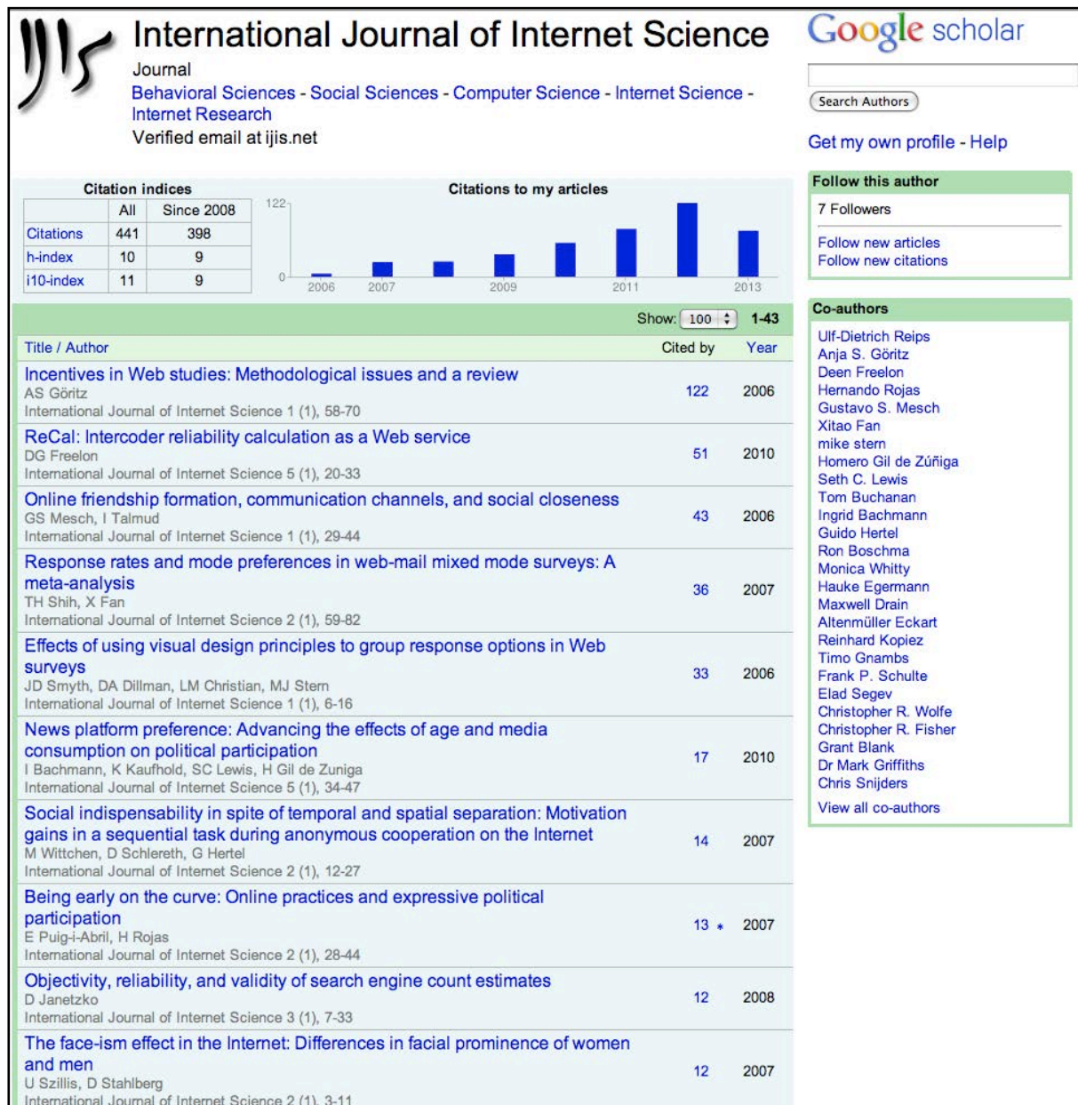
Figure 1. Web page for the International Journal of Internet Science in Google Scholar, available at http://scholar.google.com/citations?hl=en&user=OCYy1o4AAAAJ .

Thomson Reuters has confirmed the International Journal of Internet Science continues to be under evaluation for inclusion with the ISI Web of Science database. You may have seen from our editorials in issues 3(1), 6(1), and 7(1) that calculations show high journal impact, and it continues to grow, as we will show below.