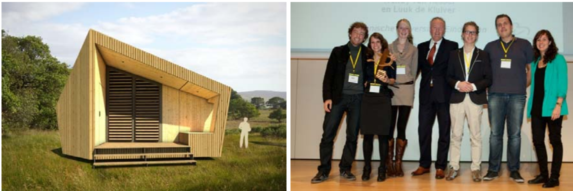
Figure 2: The Trek-in and the team participating in the Woodchallenge

The panel of judges of the Woodchallenge emphasizes the multidisciplinary aspect in their assessment: "Everything is incorporated in the design, from experience, functionality and aesthetics to the more technical aspects such as energy, ventilation, insulation, materialization, durability, prefabrication, transport and details." The judges really believed that this design could turn into a real building, which stresses the possibilities of building with wood (Juryrapport Woodchallenge, 2011).