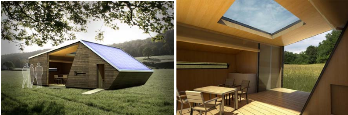
Figure 1: The Adwoodphere; the winning concept