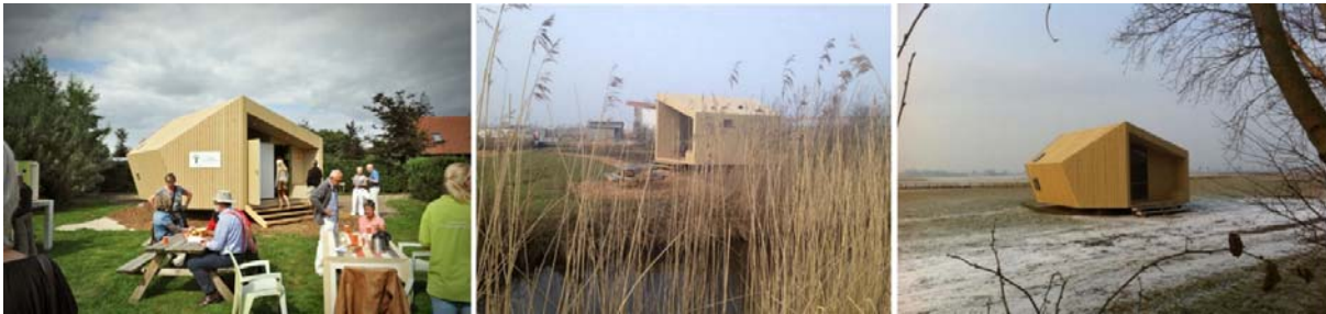
Figure 6: Already three Trek-ins are realized: at “De Barendonk” - Beers (photo left), at marina “Marnemoende” - IJsselstein (photo middle) and at “It Dreamlân” - Kollumerpomp (photo right)