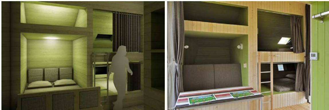
Figure 4: The comparison between an indoor render (left) and a photo of the prototype (right)