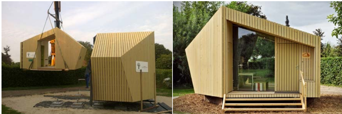
Figure 5: The prototype of the Trek-in at “De Barendonk”

The prototype is placed for a month at natural campsite “De Barendonk” in Beers to get tested. The first test was how to transport the modules and how to assemble the foundation and modules. The second test was focusing on the use and experience of users. People could stay a night in the Trek-in and received a questionnaire afterwards. They were asked a couple of questions and were able to write down additional experiences. The results are brought together by the client. The students and 2Life-Art included these points of attention in an upgraded design.