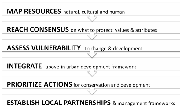
Figure 2: critical steps of HUL (adapted from UNESCO, 2011)