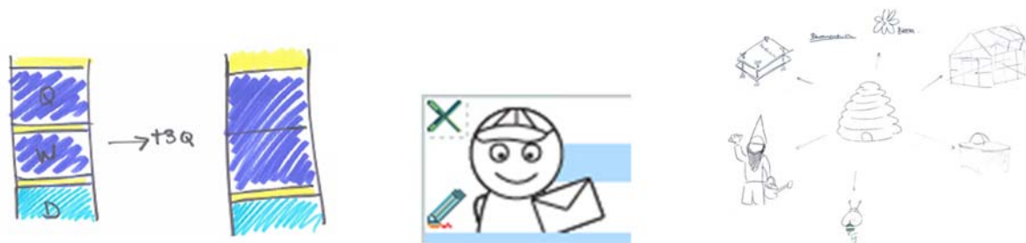
Figure 3. A pen/paper sketch (left), a digital sketch (middle) and a sketch made in a brainstorm (right) by visual designers

In the early phases of the design process visual designers are in a dialogue with interaction designers and fellow visual designers. Both dialogues are for collaboration. In a new design project the dialogue with interaction designers starts with long and iterative ideation sessions. The sessions start with co-sketching using pen and paper; in the later iterations digital sketches are also used. Visual designers think that bringing digital versions of the sketches to these ideation meetings is also important because these sketches give more realistic information about the placement and sizes of the icons (Figure 3). Early dialogue among visual designers also aims for collaboration, mainly regarding the visual styles and metaphors used in the interfaces. They do brainstorm and mood board studies together (Figure 3).