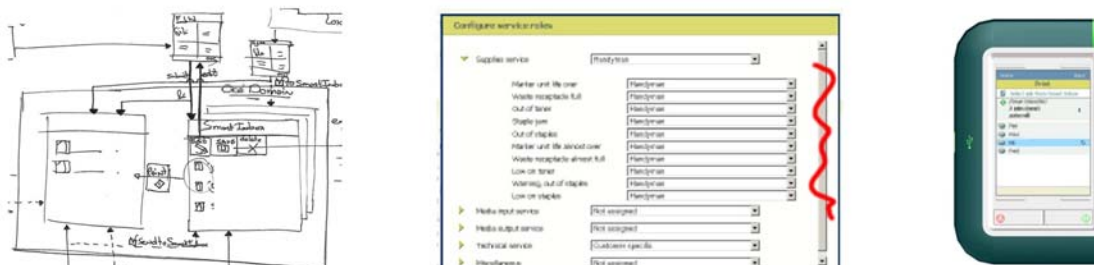
Figure 2. A hand sketch made in a meeting (left), a digital sketch made with Microsoft Sketch Flow (middle) and a screen shot from a clickable demo by interaction designers (right)

The communication between interaction designers and visual designers is for collaboration. They think that pen/paper sketches are the most suitable medium for this kind of communication. The aim of this process is to understand each other and to generate a joint idea about the design direction. Thus in this process they not only sketch to show their ideas but also to show how they interpret ideas of each other.