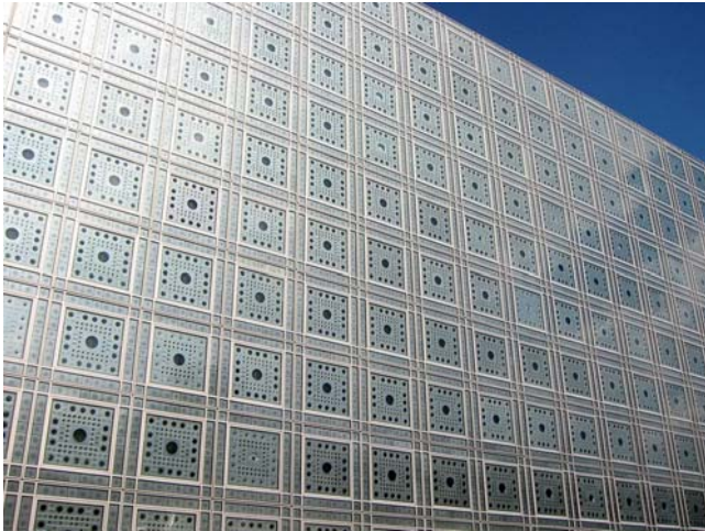
Figure 1: Arab World Institute, Paris