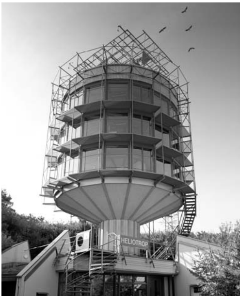
Figure 2: Heliotrop, Freiburg