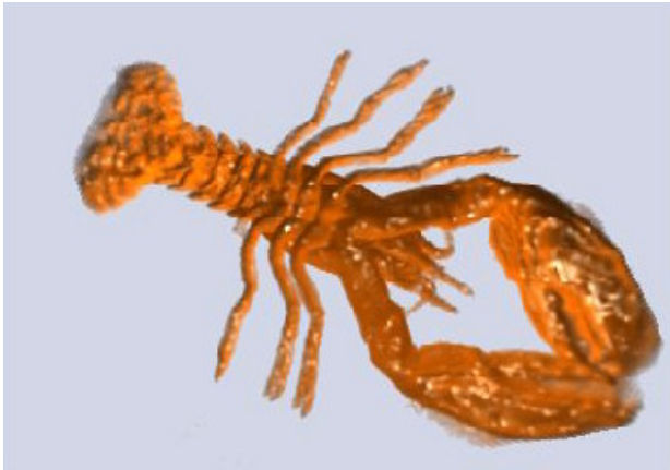
Figure 2. Perspective 3D volume rendering of the 'lobster' dataset.

In the 4th year a facultative course [6] is given by the first author: "Front-end vision and multi-scale image analysis". This course takes a multi-scale differential geometry approach to computer vision, based on bio-mimicking mathematical models of the first physiological stages of human visual perception. This intensive 2-week course is also a national PhD course. The textbook of this course is completely written in Mathematica [3], and has an included CD-ROM with the full code / text. All topics can be interactively experimented with. During the interactive computer laboratories after the lectures students individually or in pairs study the tasks in the chapters of the book by Mathematica implementation. From the review forms collected it was clear that this lab was highly appreciated. The learning curve was steep.