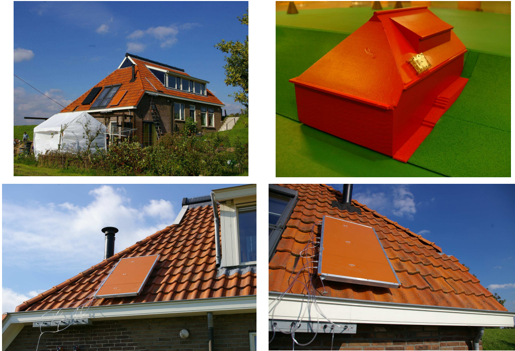
Figure 3: Pictures of the experiment on retrofit systems on pitched roofs:

The values given above are assumed to be safe values, but for economical reasons, more specific values are necessary. In the framework of the Eur Active Roofer project [14], both a full scale and a wind tunnel test were performed. Results have been given in [15]. These tests were done on single panels mounted on a pitched roof with tiles. Wind induced pressures were measured on the top and bottom surfaces of two dummy photovoltaic (PV) panels. Measurements were performed simultaneous with the on site wind speed and direction. A view of this experiment is given in figure 3.