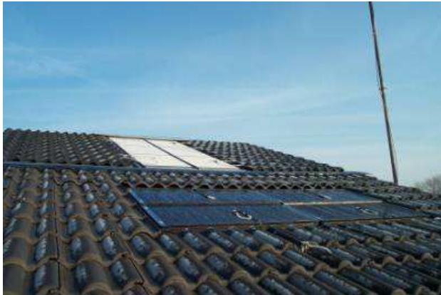
Figure 4: full scale experiment on solar panels integrated in tiled roofs.

Solar energy systems can also be an integral part of the outer layer, thus replacing the conventional roof covering such as roofing tiles. Solar panels require ventilation underneath to prevent overheating, so these systems usually are mounted with a batten space, and gaps for ventilation. These gaps enable the wind induced pressures to equalize. In this way a relatively small pressure difference is found over the outer layer, i.e. the solar panel. Based on previous experience about roofing tiles, and a comparative experiment where the pressure differences over solar panels and roofing tiles have been measured, pressure equalisation coefficients, see equation 3, have been determined.