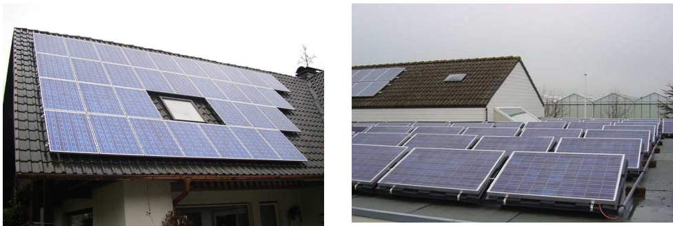
Figure 1: typical examples of Building Added Photo Voltaics; left hand side: retrofit systems on pitched roofs; right hand side: systems placed on a flat roof.

The first three aspects determine the value for the pressure or force coefficients. The fourth aspect determines the extent to which the net load on the outer layer is reduced by pressure equalisation. Current guidelines and codes do not give explicit values to account for these aspects. The values depend on the way PV systems are installed. With respect to the wind effects on solar energy systems, the category of BAPV can be divided into two classes. The first is probably the most relevant when related to the quantity of installed power: Solar systems on top of flat roofs, where the roofs usually are fully covered with solar energy systems. The solar energy systems are mounted on a substructure, which is held in place by either ballast or mechanical fixing. The second group is where (existing) pitched roofs, covered with e.g. roofing tiles or metal sheeting, are equipped with panels parallel to the roof. Typical examples of these solutions are provided in Figure 1.