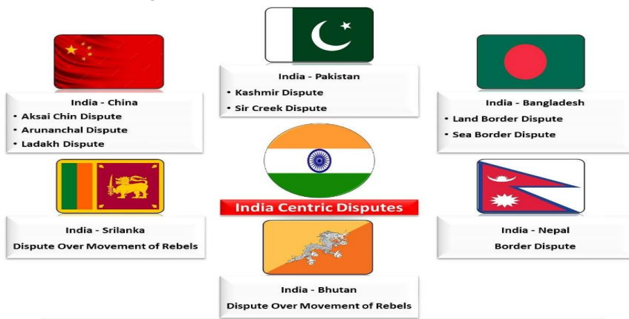
Figure 2: India-centric Disputes in South Asia

negatively impact regional peace and stability. The mindset of Indian leadership reflects Bharatiya Janata Party’s (BJP) religious-ethnic nationalism, which is mainly responsible for domestic political polarization.