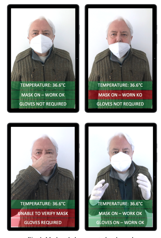
Fig. 1. Mask and gloves control, color code

Figures 1 and figure 2 illustrate the characteristics of the thermoscanner and how it works in combination with the turnstile, while figure 3 highlights the anti Covid access path devised by the team, a particularly suitable path for blocking people coming from suspicious places and confining them before can spread the virus.