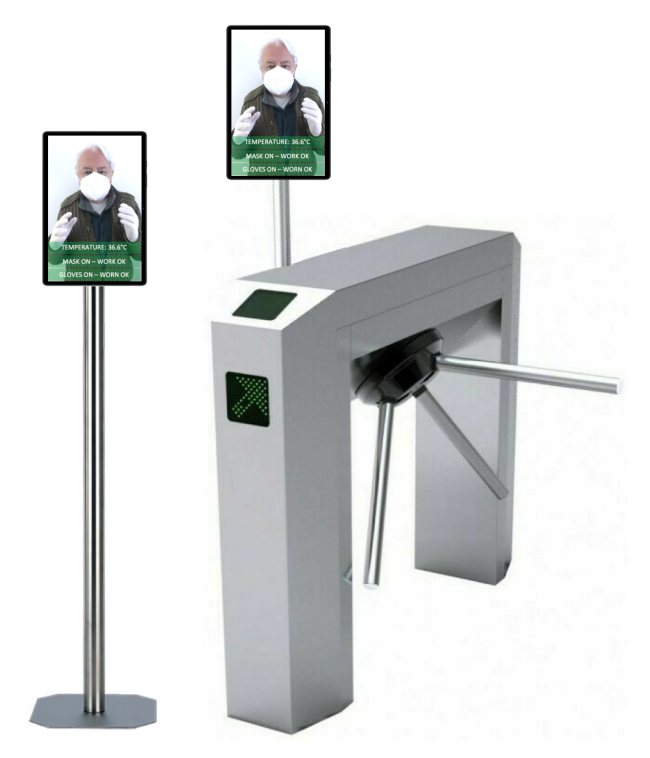
Fig. 2. Thermoscanner controls on User interface