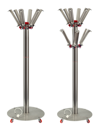
Fig. 3. UV-C and Ozone Sanitization machines

The 4.0 machine performs the sanitization by creating gaseous Ozone, which will be dismantled by the same machine at the end of the treatment, by retracing the phases found in Nature, in the Ozonosphere, described by the Chapman Cycle, thus guaranteeing the deactivation of any microorganism or pathogen such as viruses, bacteria, molds, fungi, spores (and even the elimination of insects) without using harmful chemicals and, also, at low cost (negligible consumption of energy).