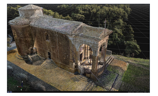
Fig. 2. View of the 3D reconstruction (photogrammetry and laser scanning) - SS. Crocifisso al Calvario Church

The software pipeline presented in this work represents a guideline for the realization of immersive experiences in cultural heritage sites by using several kinds of Virtual Reality Devices. Such devices are able to provide different performances in terms of immersion and the quality of the images. The VR headsets (Oculus, Valve Index) provide the best immer-