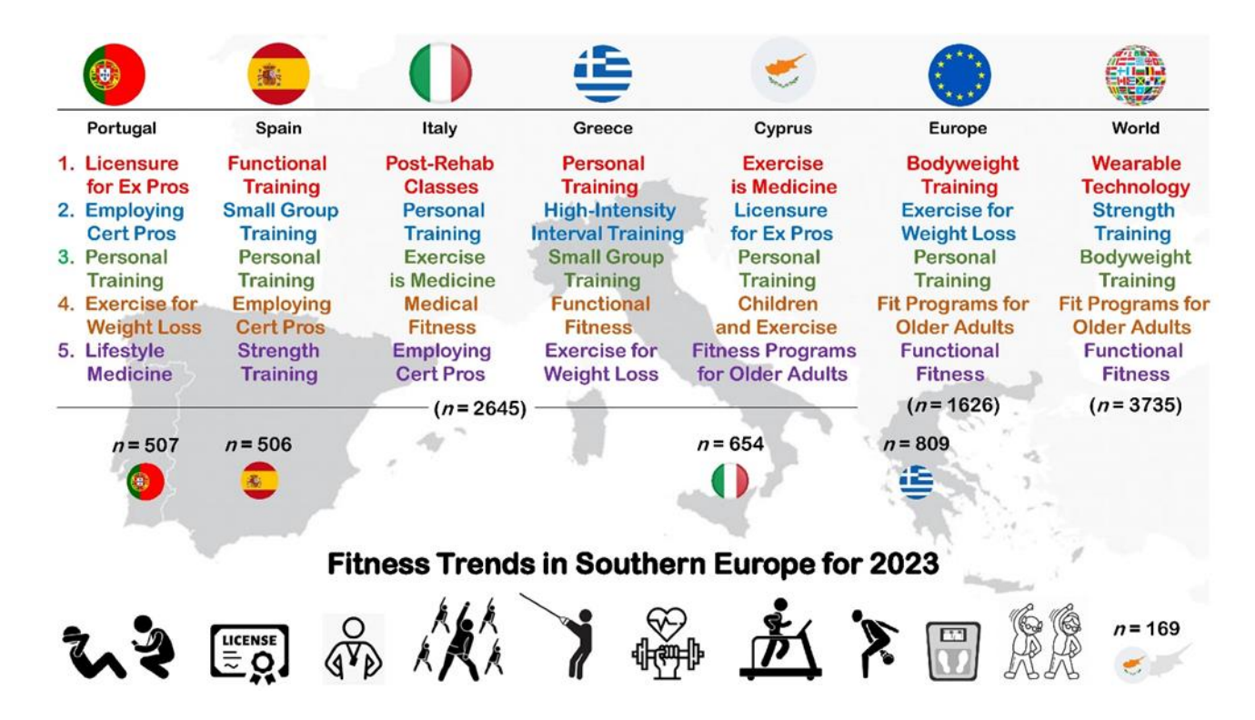
Figure 1. Top five health and fitness trends in Portugal, Spain, Italy, Greece, Cyprus, Europe and worldwide.

Greece) and Pilates (Portugal, Greece and Cyprus). In addition, a large majority of trends related to technology were not included in top 20, and only outcome measurements and wearable technology were present on the top 20 list, but not in all countries. Comparing the top 20 Southern European fitness trends with the Pan-European and worldwide ones published by the ACSM for 2023, there is one trend (boutique fitness studios) that is included only in the European list, and there are two trends (home exercise gyms and yoga) included only in the global list. Figure 1 illustrates the top five health and fitness trends in each Southern European country included in the present study in comparison to the European [49] and worldwide [33] ACSM surveys for 2023.