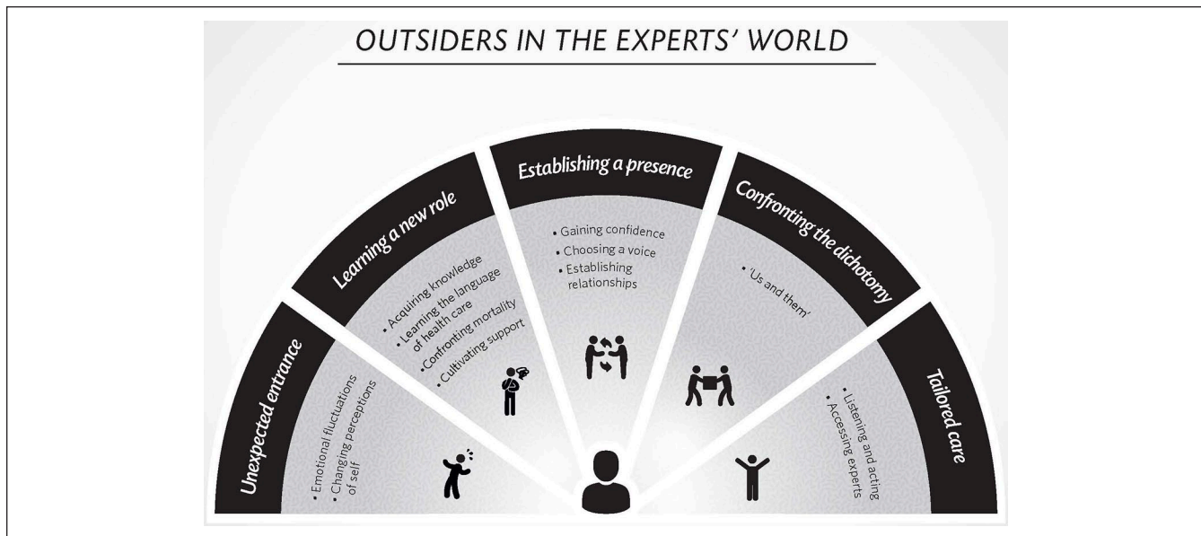
Figure 1. Grounded theory model of outsiders in the experts' world.

findings in this study suggest that consumers are outsiders in a world dominated by experts who drive the machinations of the social world of health care.