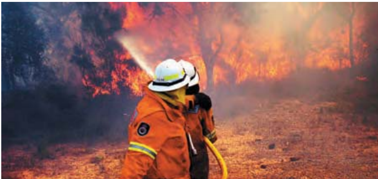
Fire fighters are endangered without vehicular escape routes when fighting fires or backburning.