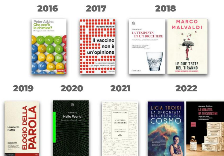
Figure 2 – List of all the winning books in the seven editions of the ASIMOV Prize.

The concluding act of each edition of the ASIMOV Prize consists of a final ceremony in which the awarded students are invited to present and discuss the finalist books. Finally, the author of the book that has scored the highest overall score, as determined by the votes of the Jurors, is declared winner of the ASIMOV Prize by the spokesperson, on behalf of the National Committee and of the Jury. The titles and the authors of the winning books of the seven editions are reported in Fig. 2. Since the first edition, the final ceremony has moved between different locations (except for editions 2020 and 2021, which were held online only due to Covid-19 restrictions).