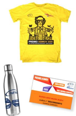
Figure 3 – Examples of gadget for students and teachers participating to the ASIMOV Prize.

In order to encourage a large participation in the ASIMOV Prize, various incentives have been devised for both students and teachers. In particular, students are encouraged to take part in the ASIMOV Prize and read at least one book to obtain school credits and/or recognition of young apprenticeship programs (for a total of 30 hours per book), which in Italy are presently called PCTO (“ Percorsi per le Competenze Trasversali e l’Orientamento ”), formerly ASL (“ Alternanza Scuola Lavoro ”), and aim to equip students with useful skills and competences for the purpose of employment. Awarded students win educational trips to one of the organizing bodies, as well as gadgets or bonuses for buying books, as shown in Fig. 3.