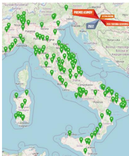
Figure 1 – Distribution of the High Schools in Italy participating in the ASIMOV Prize.