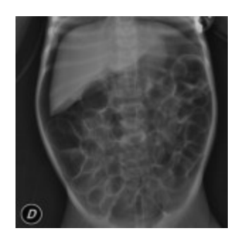
Figure 1: Click to see parts A and B. Plain abdominal x-rays were requested immediately after the end of colonoscopy, and revealed massive pneumoperitoneum.