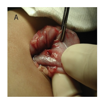
Figure 2: Click to see parts A and B. Introaperative pictures showing the perforation of the descending colon (A), that was grasped and exteriorized through the umbilical incision. The perforation was closed with interrupted stitches (B).

A 10-month old baby affected by severe commune immudeficency (SCID) complicated with chronic enteritis underwent colonoscopy with multiple biopsies. At the end of the procedure huge abdominal distension was evident and plain x-rays of the abdomen were requested, confirming the suspicion of iatrogenic perforation (Figure 1). A 0° 10-mm telescope was inserted through a trans-umbilical approach with an open technique, and pneumoperitoneum was induce with 8 mmHg of CO2 at 1 l/min.