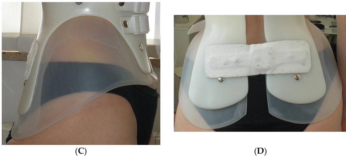
Figure 1. The two types of very rigid braces compared in the study. (A). Classical Sforzesco very rigid brace (VRB group). (B–D). Sforzesco very-rigid brace with the Free Pelvis innovation (FBP group). Posterior full brace view (B) and focus on the Free Pelvis innovation on the sagittal (C) and frontal (D) plane.

We noticed important changes in the brace characteristics and corrective biomechanics during the first months of implementation. Even though we did not perceive different results with or without FP, before further generalization and increased use, we wanted to ensure that the advantages for the patients did not come at the cost of reducing the corrective efficacy. With this aim, we planned a retrospective study to compare the short-term radiographic results (immediate in-brace and first out-of-brace follow-up) [11] in two matched VRB-treated AIS cohorts with or without FP.