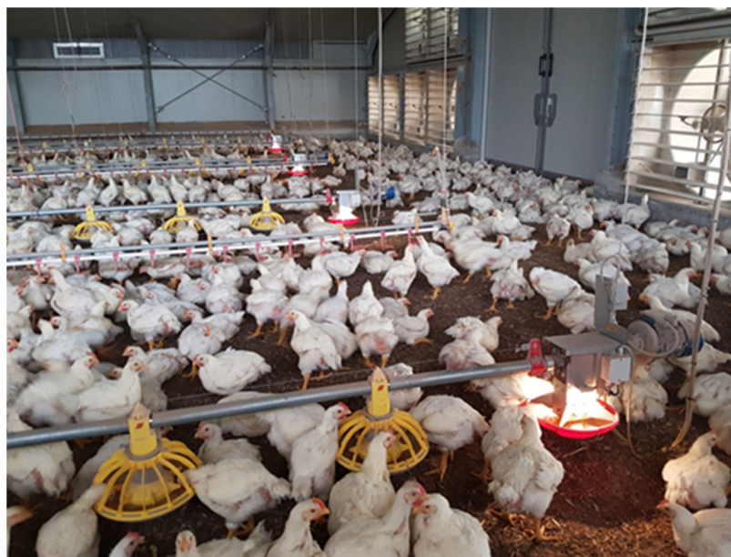
Figure 1. The feeder equipped with a LED light, applied at the end of each feeding line in F-LED.

In F-LED, the CFL lighting system was supplemented by feeders equipped with light-emitting diodes [DC12V (min 10V dc–max 14V dc); 1.2 Watt; light output: 100 lumens; correlated color temperature (CCT) 3000 \pm 200\text{K} ; Illuminated FLUXX 330 Big Dutchman, Vechta, Germany]. This illuminated feeder was located at the end of each line, with the aim to promote feeding and increase feed recall along the entire feeding line (Figure 1). The illuminated feeders were installed before the housing of chickens and were kept on following the general lighting program applied in the building. In CONTROL, no LED light was located on the feeders.