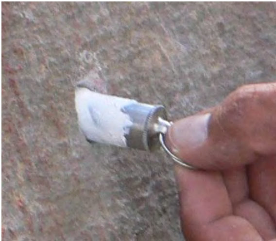
Figure 1. Inserting a TDL in a Calcschist rock.

The TDL have been inserted into different types of rock at 10 cm depth (Fig. 1). The acquisition interval is every 10 minutes in summer and every 30 minutes in the other seasons (Fig. 1).