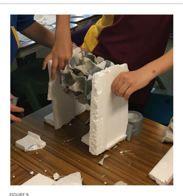
Design product for the Non-Col group showing the use of the egg cartons.

Ali: Then we can use something else and tape it ( T2 . Documenting design ideas and possibilities, focusing on high-quality designed solutions) .