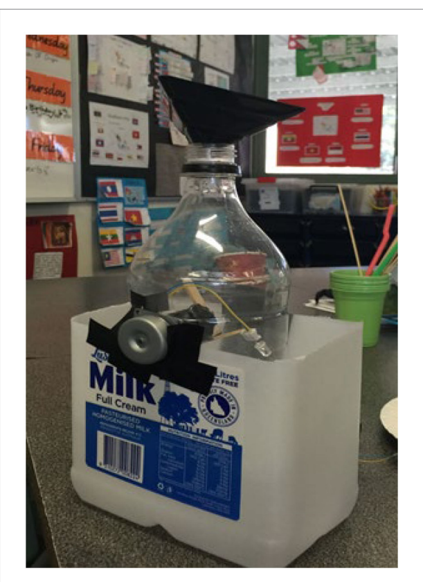
FIGURE 8 Design product for the Col group showing the use of the milk bottle.