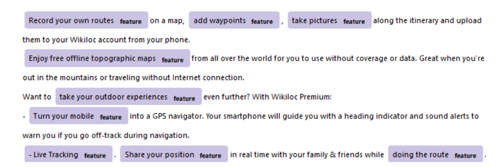
Figure 2: Sample text with highlighted features (from the description of Wikiloc's trailing app)