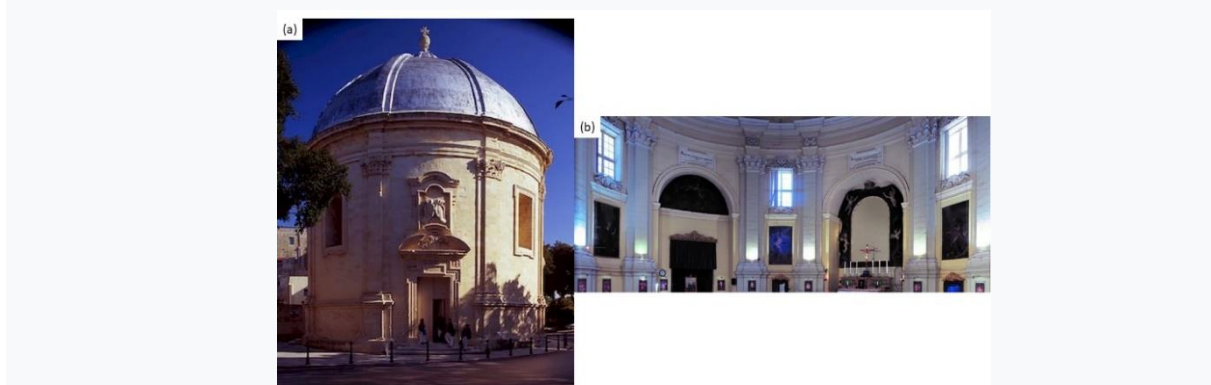
Figure 1. Church of the Immaculate Conception of Sarria, Floriana, Malta (a); detail of the interior during the restoration of the altarpiece (b).

Recently, to support the restoration works of the Pictorial Cycle, this last painting underwent a deep diagnostic and 3D survey investigation, reported elsewhere [1].