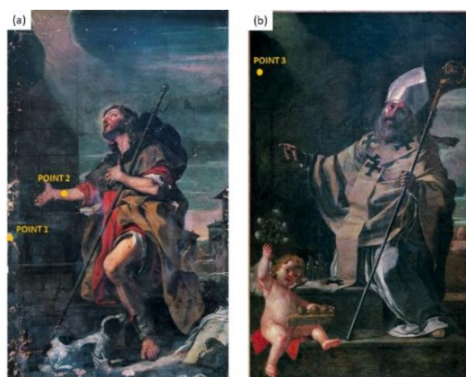
Figure 2. St. Rocco painting (a) and St. Nicola di Bari painting, with the investigated points displayed.

XRF and/or Raman analyses were carried out on some representative areas of two paintings of the Cycle, namely St. Rocco and St. Nicola Di Bari , as reported in Figure 2 and described in Table 1.