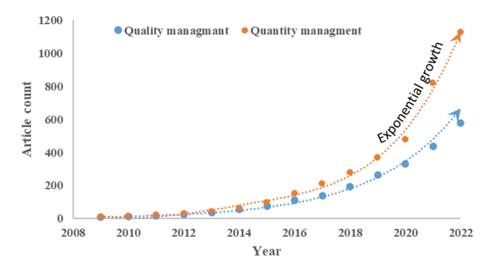
Figure 1. Arithmetical conceptualisation of growth observed in groundwater quality and quantity research using a Hybrid AI-based model during 2009–2022. Note that while these databases are comprehensive, they may not include every article published on a topic, as not all journals and conference proceedings are indexed in the Scopus database.