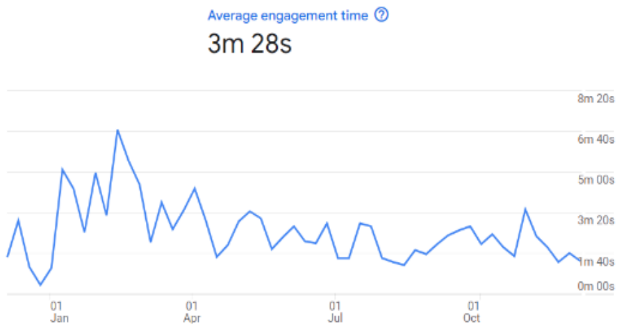
Figure 2. Session duration time

It should be noted that the average session length (Fig. 2) and user count (Fig. 3) both demonstrate that there were 5200 users during this time and that the average engagement time was 3 minutes and 28 seconds. Additionally, it was discovered that 21% of users used mobile devices to visit the website, while 78% used desktop computers. The reason probably is because there is no specific mobile app to access the Metacampus.