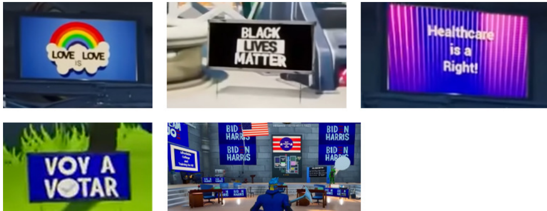
Figure 8. Billboards.

the US. According to Silverstein (2003), this could be considered an “instrument of mobilizing sentiment” (p. 533). These signs try to convey the inclusive values of the candidates, which aspire to govern for all citizens without discrimination. Furthermore, billboards are elements that we often encounter in a city, so this form of persuasive communication in games is considered useful to create realistic gameplay and has been proven not to be considered intrusive for the player, which helps to reduce players’ resistance to persuasive communication (De la Hera, 2019).