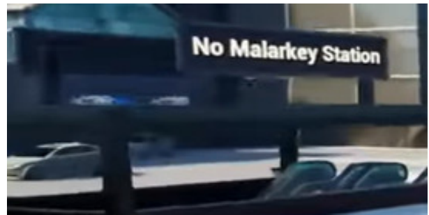
Figure 4. No Malarkey station.

Players who load up the custom map (the code is 0215-4511-1823) will find themselves wandering a windswept small-town setting that inexplicably has a subway station, devoid of all human activity as though you are the sole sinful survivor of the rapture. ( The Stranger , 11-03-2020)