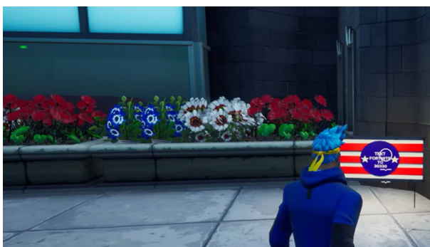
Figure 6. Flowers: Example of spatial design.

Some of the signs identified on the island are multimodal signs: That is, signs rendered in more than one mode at the same time (De la Hera, 2019). Billboards alluding to social movements can be found throughout the island. In this way, linguistic and visual signs merge and are used not only to convey information through their denotative meaning, but also through their cultural connotations. The phrases "love is love" and "Black lives matter" (see Figure 8) are currently linked to social movements—the former to the LGBT community and the latter to racial activism. Billboards in Spanish ("voy a votar") can also be found, appealing to the Hispanic community in