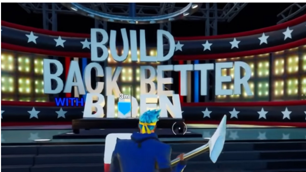
Figure 2. Title of the game.

social systems, economies, and the environment. Using this intertextual reference, both the campaign and the game could be alluding to a possible disaster brought about by the administration headed by Donald Trump. The player's goal on the island is connected to its title, which is also captured in the campaign slogan: to rebuild what has been destroyed by Trump's administration. Medhurst and Desousa (1981) explain how, in political communication, metaphors are used to "frame the election as a battle, a race, or a circus" (as cited in Bossetta, 2019, p. 3,428). It could be argued that in this case, the purpose is to frame the election as a race, in which the player is responsible for taking care of this reconstruction under time pressure.