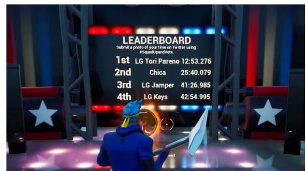
Figure 7. Leaderboard: Example of interface design.