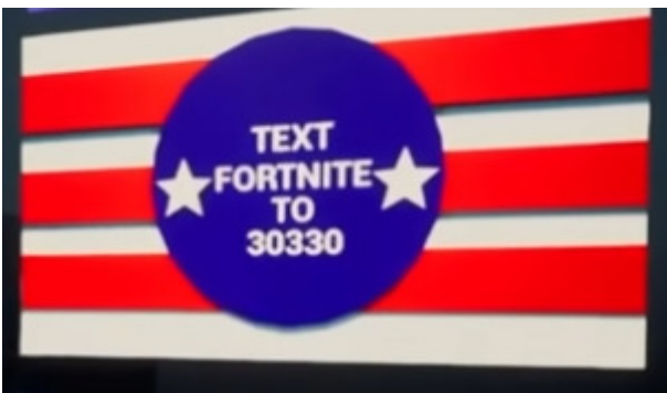
Figure 3. Instructional text.

An example of a linguistic sign in the form of an instructional text can be seen in Figure 3. This text encourages players to text a number to retrieve information on how to vote. This strategy is linked to the fact that the campaign is trying to reach young voters, some of them voting for the first time. Seven of the articles analyzed discuss this strategy. Matt Baume, from The Stranger (11-03-2020), claims that one of the purposes of this is to collect players' phone numbers and emails to add them to the official campaign mailing list. This allows the creation of a database with possible voters, in order to personalize the political content sent and monitor their behavior.